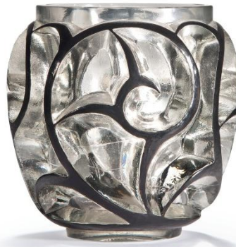
TOURBILLON VASE, NO. 973 Estimate: £15,000-20,000