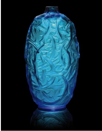
RONCES VASE, NO. 946 Estimate £6,000-8,000