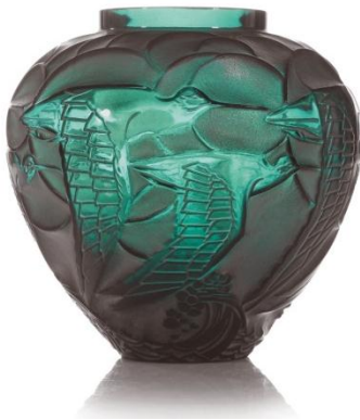
COURLIS VASE, NO. 1035 Estimate: £5,000-7,000