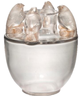
BELLECOUR VASE, NO. 993 Estimate: £25,000-35,000

PRESS CONTACT: Alexandra Deyzac | 02073892265 | adeyzac@christies.com