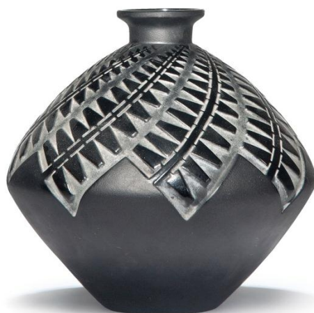
MONTARGIS VASE, NO. 1022 Estimate: £35,000-45,000