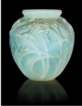
SAUTERELLES VASE, NO. 888 Estimate £20,000-30,000