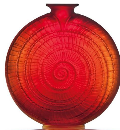
ESCARGOT VASE, NO. 931 Estimate: £25,000-30,000

London – Christie's London is pleased to announce the single owner collection Lalique: An Important Private Collection , which will take place at Christie's King Street on 30 April. The calibre of this private collection bears testimony to the discerning eye of the collector, and is a fitting tribute to the extraordinary vision and creativity of the master glass-maker René Lalique, who continues to enthrall an international audience nearly seven decades after his death. Distinguished from previous collections which have appeared on the market in the last decades, this collection primarily focuses on large-scale vases in rare designs and a wide spectrum of colours. In addition to the jewel-like coloured works, there are a number of exquisite hand-crafted cire perdue vases and a selection of significant display items, such as Oiseau De Feu , which features a mythical firebird and is illuminated from below (estimate: £25,000-35,000 illustrated right ). With estimates ranging from £2,500 to £150,000, the 84 lots are expected to realise in the region of £2 million.