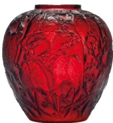
PERRUCHES VASE, NO. 876 Estimate: £20,000-25,000