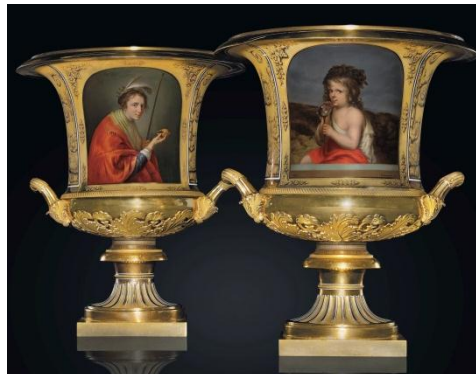
A Pair of Rare and Large Two-Handled Porcelain Vases by The Imperial Porcelain Factory, St Petersburg, Period of Nicholas I, 1840, 67 cm high Estimate: £250,000-350,000