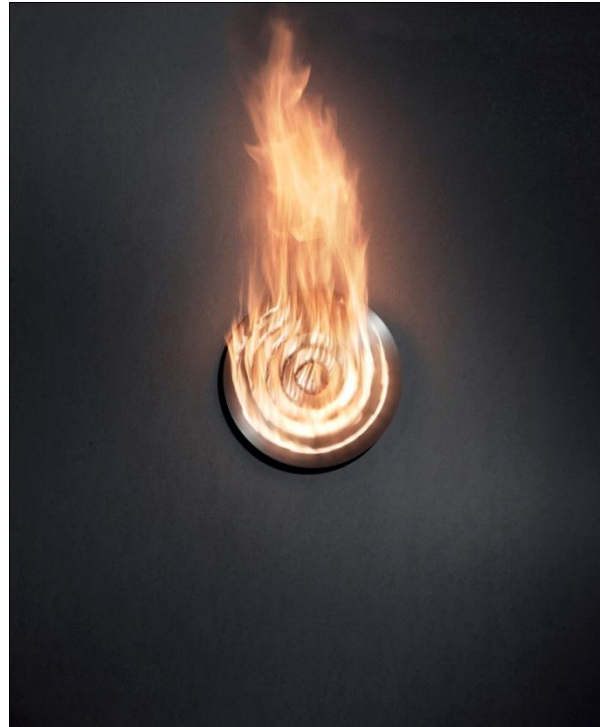
Bernard Aubertin Le disque de Feu Tournant , 1967 Matches and perforated aluminium on board 30.5 x 30.5 x 7cm