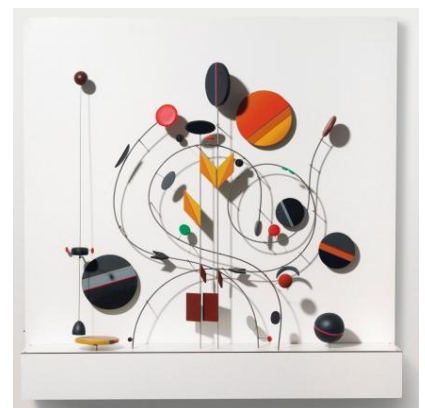
Abraham Palatnik Objeto cinético C-11-2004 Wood, industrial paint, metal and electrical motor 100 x 100 x 18 cm