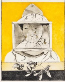
Graham Sutherland Bees , 1977 the complete set of fourteen etchings & aquatints in colours Estimate: £5,000-7,000

Pomodoro, a celebrated sculptor who began working with Stamperia d'Arte 2RC during the 1970's. The result of this intense cooperation was a series of sculptural bas-reliefs, which challenged the perception of what could be considered a print. The sculptor realised his prints first in his primary and most familiar material, clay. From this, resin moulds would be cast and pressed onto thick Fabriano card, thus creating a three dimensional paper surface. The artist continued to work and experiment with the Rossi family producing the exquisite book Frammento , in which metal elements are combined with sculpted paper to elevate printmaking to a new level of technical accomplishment.