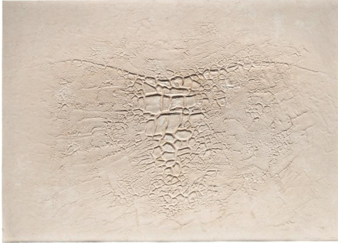
Alberto Burri (1915-1995) Cretti: H , 1971 Estimate: £8,000-12,000

Christie's South Kensington, 26 February 2014