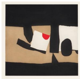
Afro Basaldella Presenza Grafica '71 , 1971 Estimate: £1,500-2,500