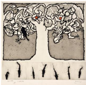
Pierre Alechinsky Arbre de vie , 1973 Estimate: £3,000-5,000

Sutherland was a versatile artist working across many mediums, returning to etching; a technique he first explored during the 1920-30s. Sutherland was guided by his knowledge and trust in the competence and sensibility of Stamperia d'Arte 2RC - shared by many of his fellow artists. The portfolio Bees bears witness to his complete immersion in the subject matter and his regained confidence with the etching technique, which allowed him to express his observation of nature.