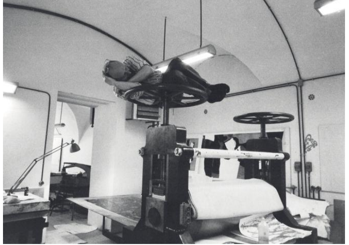
Pierre Alechinsky in Stamperia 2RC all'Ara Coeli, Rome

South Kensington – Christie's is pleased to announce the forthcoming sale of BUONO DI STAMPA: Prints from the Archive of Stamperia d'Arte 2RC to be held on Wednesday, 26 February in South Kensington. The 112 carefully selected works, which will be seen together for the first time, have been lovingly assembled over fifty years from the renowned studio of Stamperia d'Arte 2RC , that was founded in 1959 by the Rossi family in Rome, Italy. These unique prints, are the bon à tirer impressions, that tell the intimate story of trust and collaboration between artist and printer and are amongst today's most eminent artists, including Alberto Burri , Pierre Alechinsky , Arnaldo Pomodoro , Afro Basaldella , as well as Sam Francis , Henry Moore and Victor Pasmore , to name a few. Stamperia d'Arte 2RC 's long established talent and enthusiasm for printmaking has resulted in innovative and exciting techniques of style and scale. This sale presents an exceptional opportunity for established and new collectors around the world to acquire these important works; with estimates ranging from £700 up to £15,000.