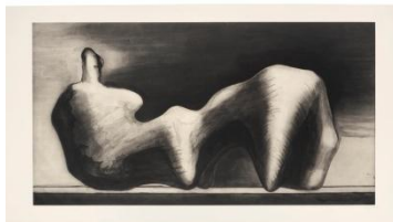
Henry Moore Stone reclining figure , 1984 Estimate: £8,000-12,000

In the 1950's Alechinsky developed an interest in oriental calligraphy, a key element of his printed oeuvre. The artist's relationship with the Rossi family was born out of shared experiences during an Eastern Mediterranean holiday. The sun, the sea and the delicate play of light that captured the imagination of artist and printmaker; so inspired, work on the copper plate for Arbre de Vie was commenced on board the sailing boat in the Bay of Bodrum in 1973.