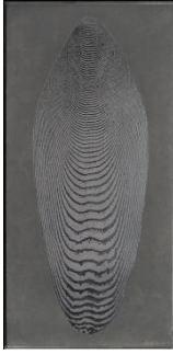
Arnaldo Pomodoro Sogno 8 , 1994 Estimate: £2,000-3,000