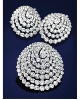
A DIAMOND BROOCH, BY VAN CLEEF & ARPELS ESTIMATE: $40,000 – 60,000