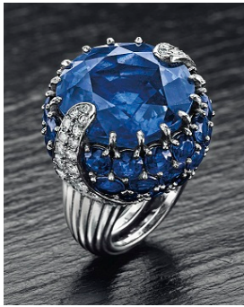
A SAPPHIRE AND DIAMOND RING, BY CARTIER ESTIMATE: $40,000 – 60,000