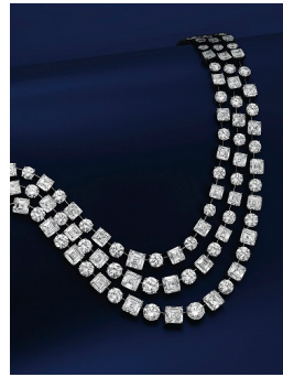
A DIAMOND NECKLACE, BY GRAFF ESTIMATE: $1,200,000 – 1,500,000