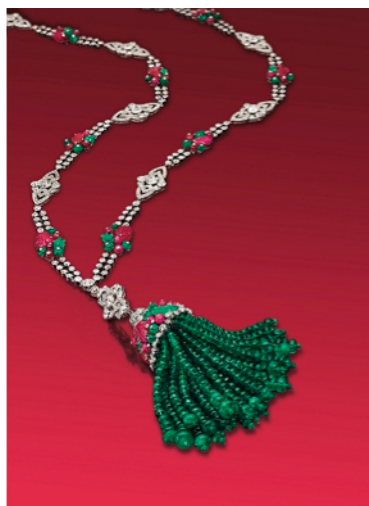
ESTIMATE: $350,000 – 450,000