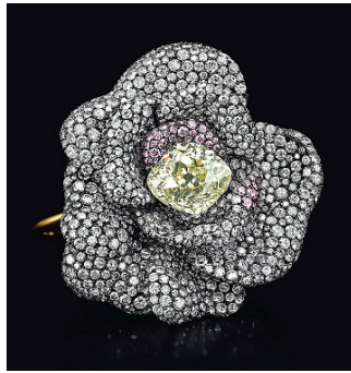
A DIAMOND AND COLORED DIAMOND FLOWER CUFF BRACELET, BY JAR ESTIMATE: $600,000 – 800,000