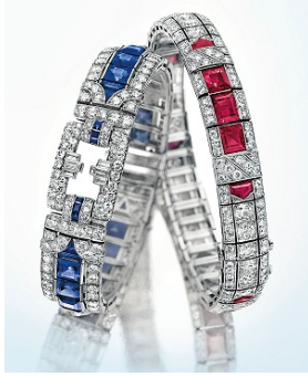
AN ART DECO SAPPHIRE AND DIAMOND BRACELET, BY CARTIER ESTIMATE: $70,000 – 100,000