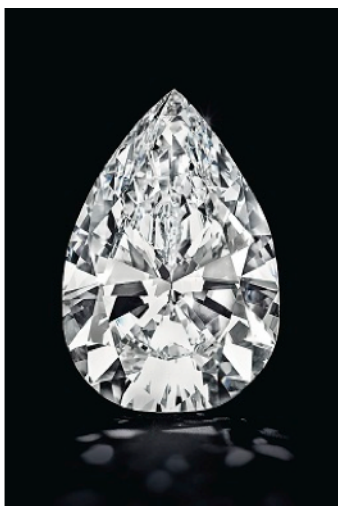
ESTIMATE ON REQUEST