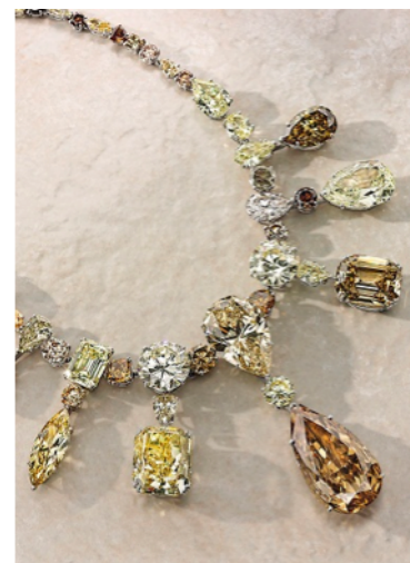
ESTIMATE: $3,000,000 – 5,000,000

NEW YORK – Heading into the holiday season, Christie's New York will offer over 300 lots in their Magnificent Jewels auction on December 10 at its flagship Rockefeller Center saleroom. From rare and important colored and colorless diamonds, superb gemstones, natural pearls, signed and period jewels, the auction features elegant creations from famed jewelry houses such as Boivin, Boucheron, BVLGARI, Cartier, Fouquet, Graff, JAR, Tiffany & Co., Van Cleef & Arpels, and Harry Winston to name a few. The two-session auction includes prices ranging from $1,000 to $10,000,000 and is expected to realize in excess of $55 million.