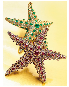
A RUBY AND AMETHYST STARFISH BROOCH, BY RENÉ BOIVIN ESTIMATE: $80,000 – 120,000

FORMERLY THE PROPERTY OF THE DUCHESS OF WINDSOR