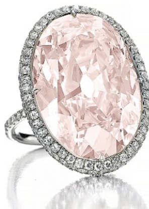
ESTIMATE: $4,000,000 – 6,000,000