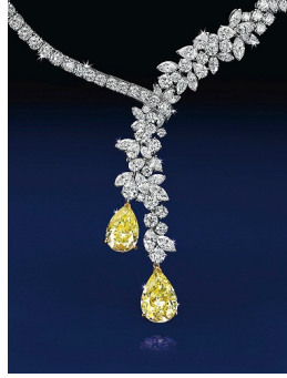
A COLORED DIAMOND AND DIAMOND "FARANDOLE" NECKLACE, BY VAN CLEEF & ARPELS ESTIMATE: $300,000 – 500,000