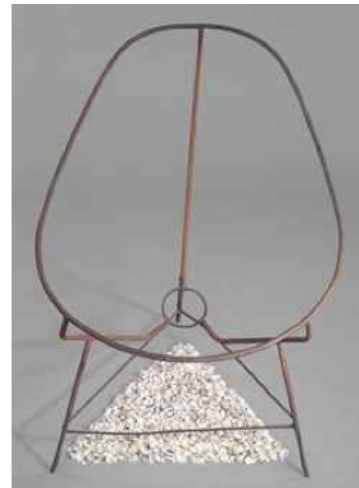
GABRIEL OROZCO (MEXICAN B. 1962) CONCHA CON CONCHAS IRON CHAIR AND SEASHELLS EXECUTED IN 1999 ESTIMATE: $60,000 – 80,000