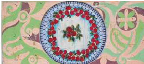
BEATRIZ MILHAZES (BRAZILIAN B. 1960) MATRYOSHKAS OIL ON CANVAS PAINTED IN 1994 ESTIMATE: $300,000 – 500,000