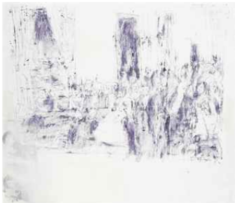
ENOC PEREZ (PUERTO RICAN B. 1967) UNTITLED (AUDIENCE) OIL ON CANVAS PAINTED IN 1991 ESTIMATE: $40,000 – 60,000