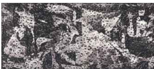
VIK MUNIZ (BRAZILIAN B. 1961) GUERNICA AFTER PABLO PICASSO (GORDIAN PUZZLES) CHROMOGENIC PRINT EXECUTED IN 2009 ESTIMATE: $60,000 – 80,000