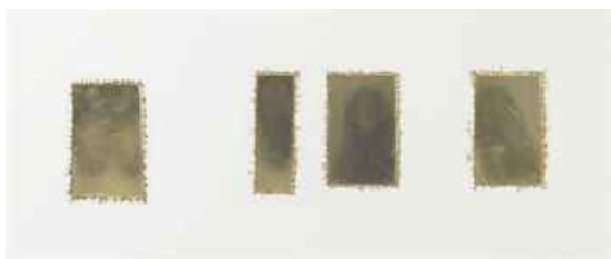
DORIS SALCEDO (COLOMBIAN B. 1958) ATRABILIARIOS FOUR INCHES: WOOD, SHEETROCK, SHOES, ANIMAL FIBER AND SURGICAL THREAD EXECUTED IN 1993 ESTIMATE: $50,000 – 70,000