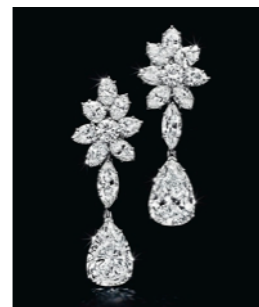
A Pair of Pear-Shaped D-color Diamond Ear Pendants of 5.51 and 5.36 carats Estimate: $550,000 – 650,000