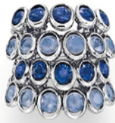
A sapphire and chalcedony "Quatre Corps" ring, by René Boivin Estimate: $4,000 – 6,000