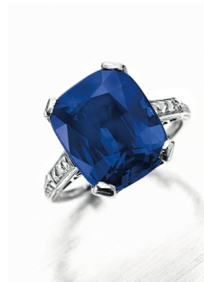
A Kashmir Sapphire of 10.74 carats, Circa 1910. Estimate: $300,000 – 500,000

PRESS CONTACT: Gabriel Ford | +1 212 492 5704 | GFord@christies.com