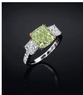
A Square-Cut D-color Fancy Intense Green Diamond of 3.60 carats Estimate: $800,000 – 1,200,000