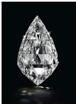
A Briolette Cut D-color Flawless Diamond of 50.05 carats Estimate: $5,500,000 – 7,500,000