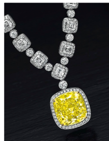
A Cushion-Cut Fancy Vivid Yellow Diamond Necklace of 20.34 carats, by Tiffany & Co. Estimate: $1,000,000 – 1,500,000