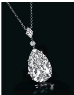
A Pear-Shaped D-color Diamond of 24.53 carats Estimate: $1,300,000 – 1,800,000