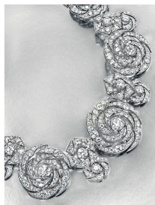
An Openwork Old European and Single-Cut Diamond and Platinum Necklace, by Cartier (1942). Estimate: $450,000 – 650,000