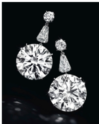
A Pair of Circular-Cut D-color Internally Flawless Diamond Ear Pendants of 22.60 and 22.31 carats Estimate: $7,000,000 – 10,000,000