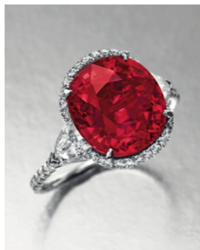
A Burmese Ruby and Diamond Ring of 6.25 Carats Estimate: $1,000,000 – 1,500,000