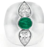
An Art Deco emerald, diamond, and rock crystal "Roof" ring, by Suzanne Belperron Estimate: $70,000 – 100,000