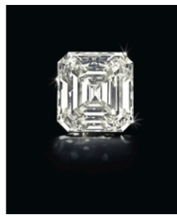
A Rectangular-Cut L-color Diamond of 42.96 carats Estimate: $1,300,000 – 1,500,000