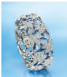
A diamond, sapphire, and emerald "En Vole" bracelet, by Cartier Estimate: $60,000 – 80,000