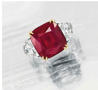
A Burmese Ruby of 8.05 carats Estimate: $1,000,000 – 1,500,000