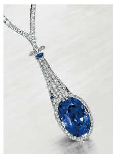
An Art Deco Sapphire and Diamond Necklace of 29.59 carats, by Tiffany & Co. Estimate: $120,000 – 180,000

Great design is the core of what makes classic jewelry hold its value over the long term, and Christie's is honored to present the most significant examples from the major jewelry houses in each of its auctions this spring. In New York, Christie's presents over sixty signed jewels by Suzanne Belperron, René Boivin, BVLGARI, Cartier, Tiffany & Co., Van Cleef & Arpels, David Webb, and Harry Winston, among others.