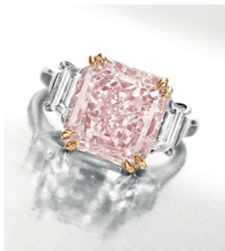
A Rectangular-Cut Fancy Intense Pink Diamond Ring of 6.10 carats, by Harry Winston Estimate: $4,000,000 – 6,000,000