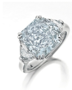
A Rectangular-Cut Fancy Gray-Blue Diamond Ring of 5.17 carats Estimate: $800,000 – 1,200,000