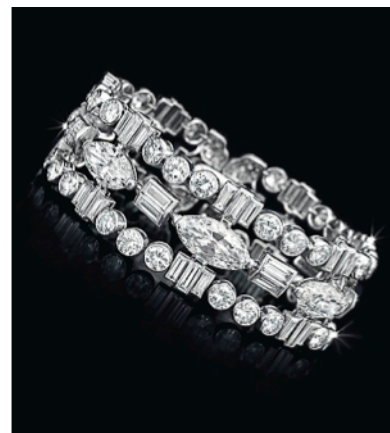
An Art Deco Diamond Bracelet, by Cartier Circa 1930 Estimate: $300,000 – 500,000