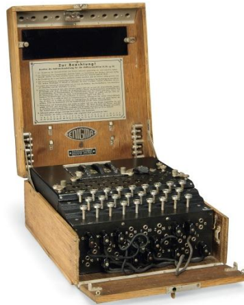
A THREE-ROTOR ENIGMA CIPHER MACHINE, circa 1939 Estimate: £40,000 – 60,000