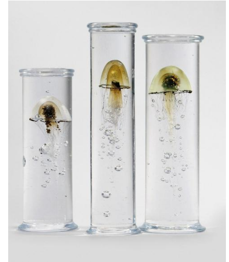
THREE DANISH GLASS MODELS OF JELLYFISH IN TUBES 2009, BY STEFFEN DAM (b.1961) Estimate: £8,000-12,000