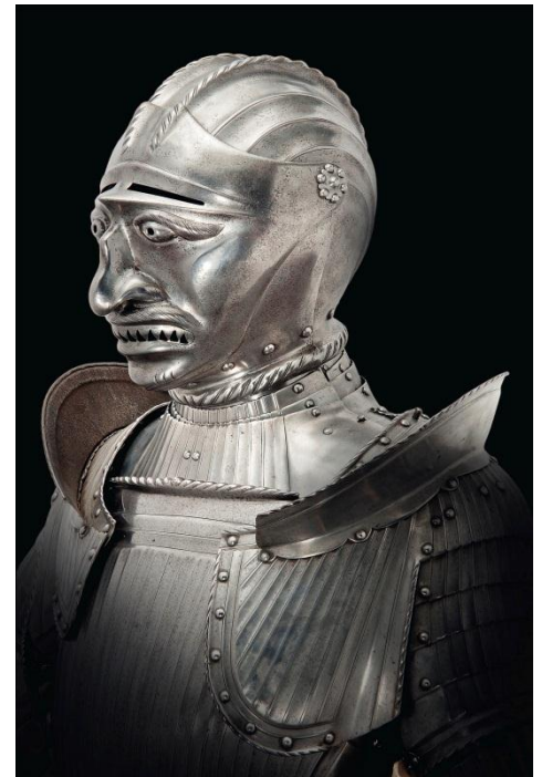
A fine Victorian German 'maximilian' armour in the 16 th -century style Estimate: £25,000-30,000