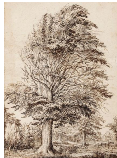
Jacques de Gheyn II (circa 1565-1629) A large beech tree Estimate: £300,000 – 400,000

One of van Regteren Altena's greatest achievements as a scholar was the rediscovery of an extraordinary artist, Jacques de Gheyn II (circa 1565-1629) , on whom he published, posthumously, a catalogue raisonné. It is due to his remarkable effort that de Gheyn is today seen as one of the greatest draftsmen of his time. In total the collection includes 20 drawings by de Gheyn, an unsurpassed group displaying the unrivalled alchemy of his art. Leading the selection of works by de Gheyn is A large beech tree (estimate: £300,000 – 400,000, illustrated right ).