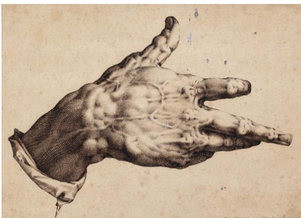
Hendrick Goltzius (1558-1617)

A young man leaning on a stick Estimate: £250,000 – 350,000