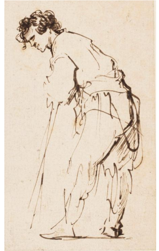
Rembrandt Harmensz. van Rijn (1606-1669)

A young man leaning on a stick by Rembrandt Harmensz. van Rijn (1606-1669) is a characteristic example of Rembrandt's figure drawings produced while he was working in Leiden (until ca. 1631) (estimate: £250,000 – 350,000, illustrated right ). Depicting a beggar, it can be related to a series of etchings of the same subject dating from 1629 onwards. Loosely and sketchily executed without any continuous pen lines, the drawing conveys a remarkable plasticity and suggestion of form in a very natural and lively way.