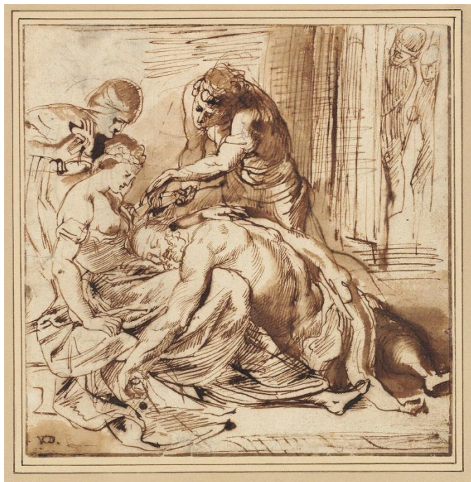
Peter Paul Rubens (1577-1640) Samson and Delilah Estimate £1.5 - 2.5 million