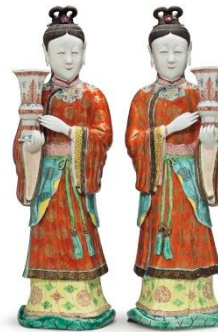
A Large Pair Of Famille Rose Court Lady Candleholders Circa 1770 Estimate: $40,000 - 60,000