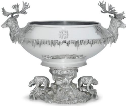
A Silver ice bowl in Alaskan style Gorham Mfg .Co., Providence, circa 1868 Estimate: $20,000 - 30,000