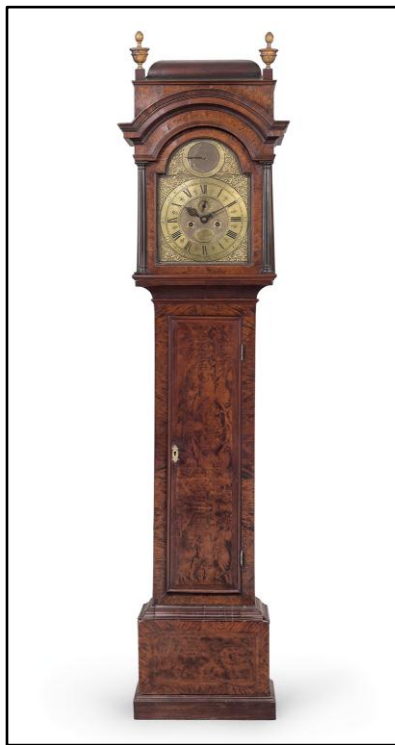
American Furniture, Outsider and Folk Art January 23