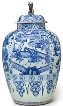
A Massive Blue And White Jar And A Cover Kangxi period Estimate: $12,000 - 18,000