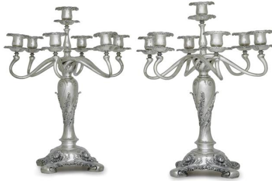
A pair of silver Chrysanthemum-pattern seven light candelabra Tiffany and Co. New York 1907-47 Estimate: $40,000 - 60,000