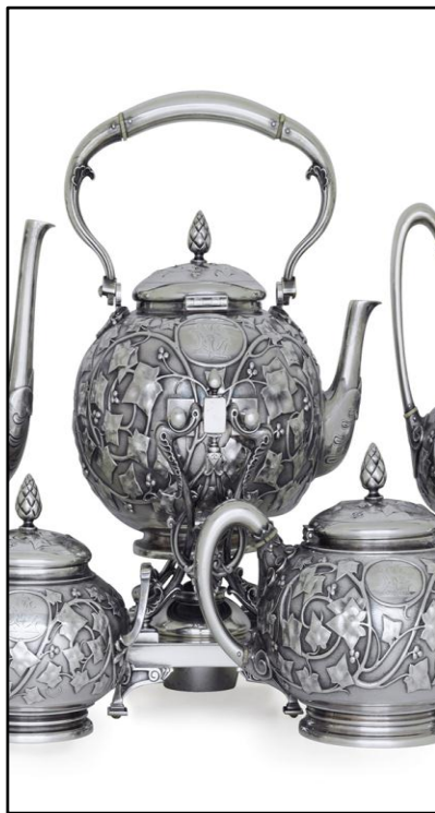
Important American Silver January 22