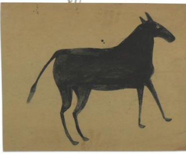
Bill Traylor (1854 -1949) Black Mule , dated circa 1939-42 opaque watercolor and graphite on found card Estimate: $20,000 – 40,000

This large-format mule renders a strong and solid animal through bold opaque watercolor. After a lifetime on a plantation, former slave Traylor moved to Montgomery, Alabama, in his old age. Crippled with rheumatism, he began to draw. Traylor worked on found cardboard, and per later accounts would hang his drawings by a small loop of string along a nearby fence. Black Mule retains this string fastened through a puncture at the top of the composition.