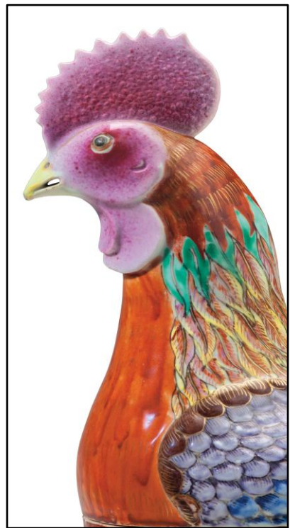
MANDARIN & MENAGERIE: The Sowell Collection and Chinese Export Art from Various Owners January 26