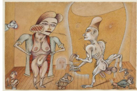
JIM NUTT (b. 1938) Why? How is it Done? color pencil on paper 8 x 12 1/8 in. (20.3 x 30.8 cm.) Executed in 1978. Estimate: $6,000-8,000

Several works from Jim Nutt , Gladys Nilsson and Ed Paschke , will be offered in the First Open sale. All of these artists were Chicago Imagists, a term that describes a number of groups made up of artists that attended the School of the Art Institute of Chicago (SAIC) from the late 1950s through the 60s and 70s. The style of the Chicago Imagists is broadly characterized by representational work influenced by Surrealism and Art Brut. Many Chicago Imagists also drew on references outside of fine art, such as comics, cartoons, and popular culture. Jim Nutt's Why? How is it Done? (estimate: $6,000-8,000) is an excellent example of the vibrant visual vocabulary that epitomized the diverse artistic practices and styles of the Chicago Imagists. Jim Nutt was a member of Hairy Who, one of the most visible movements associated with the Chicago Imagists in the 1960s and 1970s. His graphic, vividly sexual, and psychological work was influenced by African and American Indian art, Surrealism, Expressionism, and the illustration of comic books. Nutt and his peers forged a unique style that was consciously separate from New York centered Pop and Minimalism that were the reigning art movements of the day.