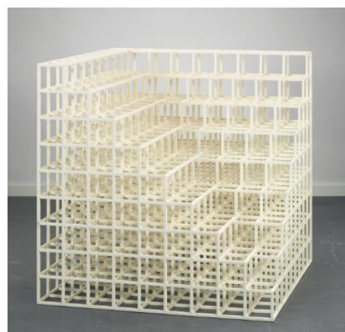
SOL LEWITT (1928-2007) Corner Piece #3 acrylic on wood 43 1/4 x 43 1/4 x 43.1/4 in. (110 x 110 x 110 cm.) Executed in 1976. Estimate: $150,000-200,000

Coinciding with the first comprehensive retrospective at New York's Museum of Modern Art, Christie's is glad to offer a rare diptych by Sigmar Polke . The German artist constantly defied aesthetic boundaries in his work, extending the visual vocabularies of painting, photography, and printmaking through a mercurial working process. His investigations into the effects that can be achieved by embracing a vast range of materials, pictorial sources, and art practices have been highly influential to successive generations of artists. Untitled from 1973 (estimate: $ 50,000-70,000), dates from a period of great social, political, and artistic unrest, as well as widespread experimentation with countercultural lifestyles and hallucinogenic drugs.