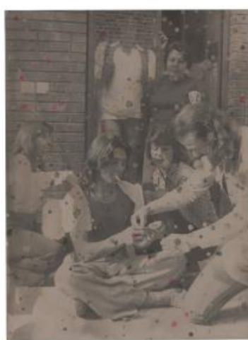
SIGMAR POLKE (1941-2010) Untitled two elements--ink and paint on gelatin silver print each: 9 1/4 x 6 7/8 in. (23.5 x 17.5 cm.) Executed in 1973. Estimate: $50,000-70,000