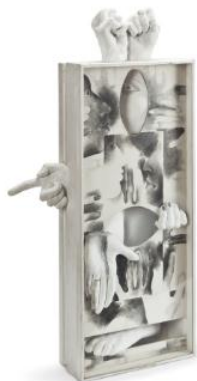
MARISOL (b. 1930) Untitled (White Box) box construction-wood, glass, plaster, graphite and paperboard 31 x 16 x 4 3/8 in. (78.7 x 40.6 x 11.1 cm.) Executed in 1961. Estimate: $8,000-12,000

Several works from Jim Nutt , Gladys Nilsson and Ed Paschke , will be offered in the First Open sale. All of these artists were Chicago Imagists, a term that describes a number of groups made up of artists that attended the School of the Art Institute of Chicago (SAIC) from the late 1950s through the 60s and 70s. The style of the Chicago Imagists is broadly characterized by representational work influenced by Surrealism and Art Brut. Many Chicago Imagists also drew on references outside of fine art, such as comics, cartoons, and popular culture. Jim Nutt's Why? How is it Done? (estimate: $6,000-8,000) is an excellent example of the vibrant visual vocabulary that epitomized the diverse artistic practices and styles of the Chicago Imagists. Jim Nutt was a member of Hairy Who, one of the most visible movements associated with the Chicago Imagists in the 1960s and 1970s. His graphic, vividly sexual, and psychological work was influenced by African and American Indian art, Surrealism, Expressionism, and the illustration of comic books. Nutt and his peers forged a unique style that was consciously separate from New York centered Pop and Minimalism that were the reigning art movements of the day.