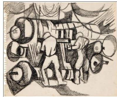
Jacob Lawrence Massachusetts Textile Mill Study III (Two Figures)