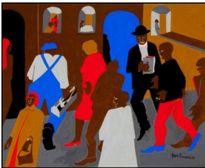
Jacob Lawrence Windows