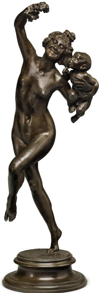
Frederick William MacMonnies, 'Bacchante and Infant Faun' bronze with brown patina, 32½ in. high on a separate 42 in. carved wooden pedestal Estimate: $12,000-18,000