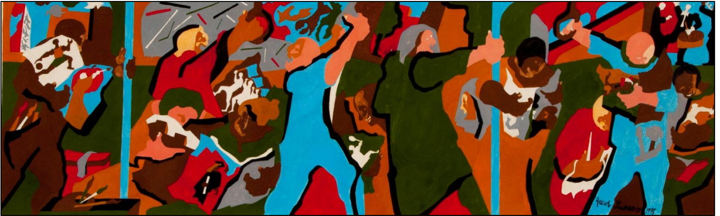
Jacob Lawrence, New York in Transit I , gouache and pencil on paper, Estimate: $50,000-70,000

ONLINE SALE OPEN FOR BIDDING ON FEBRUARY 21 LIVE AUCTION ON FEBRUARY 26