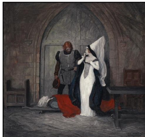
Newell Convers Wyeth "At Daybreak, Mistress, in Execution of the Sentence Passed Upon Him Yesterday in the Governor's Court" oil on canvas, 30¼ x 32 in., Painted in 1929. Estimate: $100,000-150,000

PRESS CONTACT: Jaime Bernice | +1 212 636 2680 | jbernice@christies.com