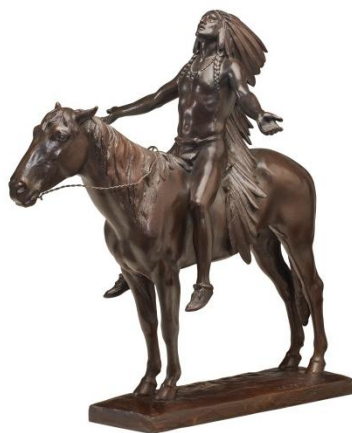
Cyrus Edwin Dallin 'Appeal to the Great Spirit' bronze with red-brown patina, 21¼ in. high Estimate: $40,000-60,000