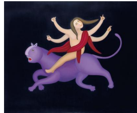
Manjit Bawa, Untitled (Durga) Estimate: $380,000-450,000

by ancient mythology and Hindu literature, and in the present work he depicts Durga, the female supreme deity, mounted on the back of her lion. Bawa's use of space and color creates a mesmerizing composition that conjures a window into a world of imagination, myth, mysticism and magic.