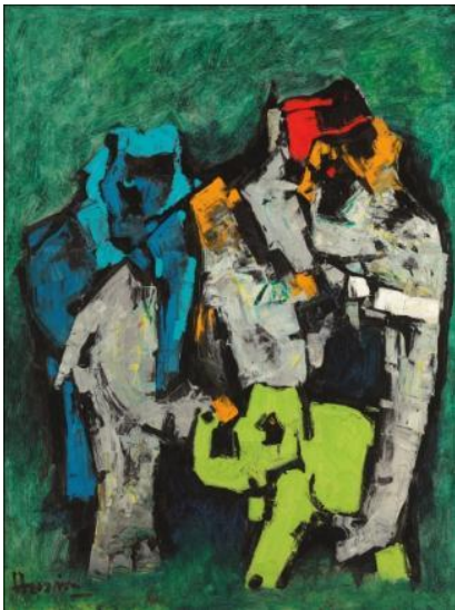
Maqbool Fida Husain, Untitled (Elephants) Estimate: $100,000-150,000

Following the auction of A Pioneering Vision is the South Asian Modern + Contemporary Art sale, which will feature 70 lots, offering iconic works by leading modernist masters Syed Haider Raza, Maqbool Fida Husain, Manjit Bawa, and Jagdish Swaminathan. The sale will be led by Manjit Bawa's monumental masterpiece Untitled (Durga) (illustrated right; estimate: $380,000-450,000). Bawa distilled figuration to its most elemental