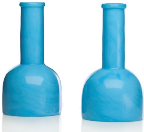
A Rare Pair Of Opaque Sky-Blue Glass Mallet-Shaped Vases Estimate: $40,000-60,000