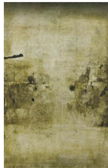
Vasudeo S. Gaitonde, Untitled Estimate: $750,000-900,000

Among the highlights of the sale is Vasudeo S. Gaitonde's Untitled (illustrated right; estimate: $750,000-900,000), painted in 1971. Gaitonde is recognized as having been an innovator and stands apart from his Indian contemporaries for his espousal of a purely abstract aesthetic in art. The work to be offered in September showcases