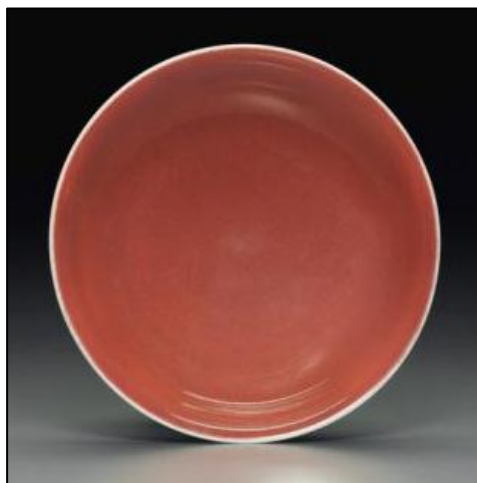
A Rare 'Sacrificial Red' Dish Estimate: $120,000-180,000