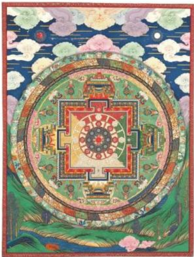
A painting of a Vajravarahi thirty-seven-deity mandala Estimate: $80,000-120,000

This sale also includes a selection of paintings highlighted by a Tibeto-Chinese painting of a Vajravarahi thirty-seven-deity mandala (illustrated left; estimate: $80,000-120,000), circa 1740-1763. An inscription at the bottom of this exquisite painting indicates that it was commissioned by Yintao, the 12 th of twenty sons of the Kangxi Emperor and designed by Changkya Rolpa'l Dorje, the personal Buddhist teacher of the Qianlong Emperor and head lama in Beijing during the 18th century.