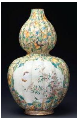
A Rare Large Painted Enamel Double-Gourd Vase Estimate: $80,000-120,000