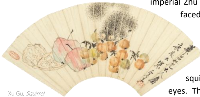
Xu Gu, Squirrel