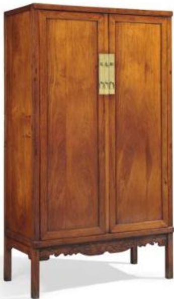
A Magnificent Pair of Huanghuali Square-Corner Cabinets, Fangjiaogui Estimate: $500,000-800,000

Christie's sale of Fine Chinese Ceramics and Works of Art will be held over the course of two days, featuring over 600 lots that span over 3,000 years and numerous collecting categories, including jade and hardstone carvings, fine classical Chinese furniture, archaic bronzes, early pottery and later porcelains, gilt-bronze Buddhist figures, imperial glass, and snuff bottles.