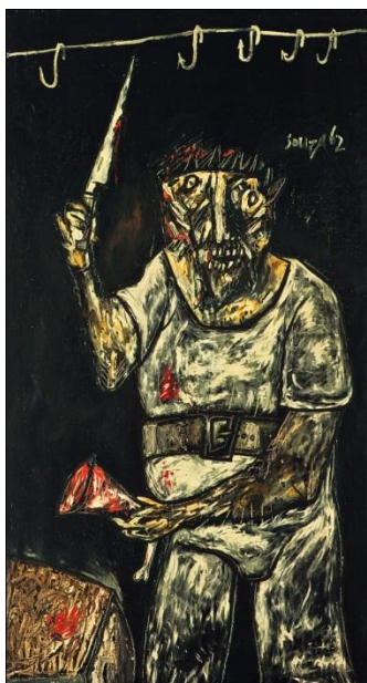
Francis Newton Souza, The Butcher Estimate: $1,500,000-2,000,000

Gaitonde as a painter, philosopher and alchemist at the zenith of his career. His fully matured and resolved style creates a harmonious symphony of the abstract, minimalist and conceptual aesthetic.