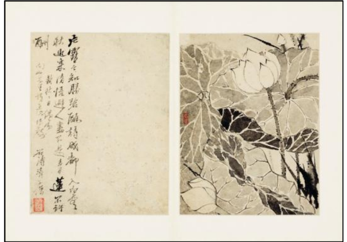
Shitao, Plants and Calligraphy

imperial Zhu family, into which he was born, despite the political oppression he faced with the rise of the Qing dynasty.