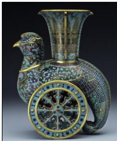
A Rare Cloisonné Enamel Archaistic 'Wheeled' Phoenix-form Vase, Zun Estimate: $60,000-80,000

also features a selection of outstanding works from the Collection of David B. Peck III, including a rare large cloisonné enamel ram and vase group, 18 th century (estimate: $40,000-60,000) and a rare cloisonné enamel archaistic 'wheeled' phoenix-form vase, zun , Qianlong period (1736-1795) (estimate: $60,000-80,000).