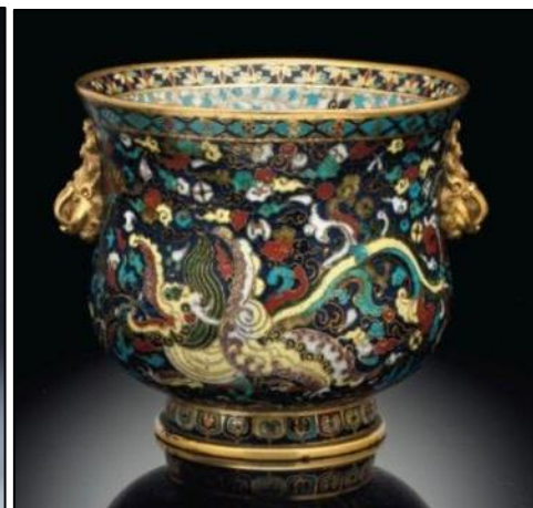
A Superb and Very Rare Cloisonné Enamel Deep Bowl Estimate: $300,000-500,000