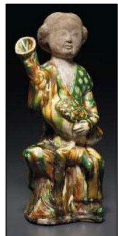
A Sancai -Glazed Pottery Figure Of A Woman Holding A Goose Estimate: $30,000-50,000