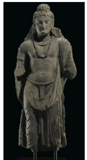
A gray schist figure of a bodhisattva

Among the sale highlights is a 2 nd /3 rd century Gandharan gray schist figure of a bodhisattva (illustrated right; estimate: $250,000-350,000), one who has achieved enlightenment but has forgone nirvana (the escape from rebirth) to serve as guides for all sentient beings. The iconography, such as the topknot, rich vestments, jeweled foliate collar, and rope-work necklace, leads one to believe that this figure represents either Maitreya, the Buddha of the future, or the historical Prince Siddhartha. The naturalistic attention to drapery employed in this example is characteristic of the Gandharan period and drawn from the earlier Greco-Roman influence in the region. The figure's left knee is slightly bent, as if he has just taken a step forward, conveying a subtle yet powerful sense of moving closer to the viewer.