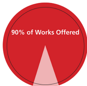
WORKS OFFERED FRESH TO MARKET For the First Time in 10+ Years

● Offered for the first time in a decade+ ● Offered within the last decade