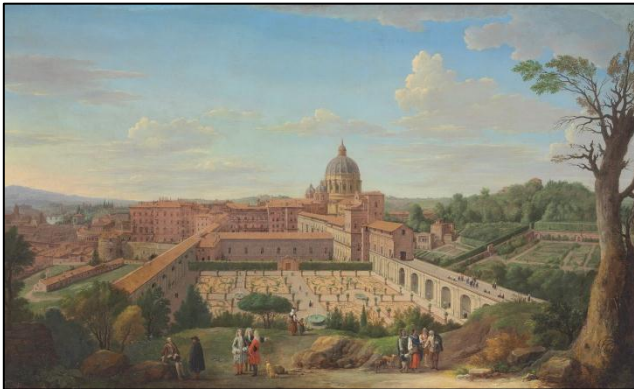
Hendrik Frans van Lint, called lo Studio (1684-1763) A view of Rome with Saint Peter's Basilica seen from the north, showing the Giardino Segreto with the arms of Pope Clemente XI Albani and the Giardino Comune, with elegant figures in the foreground, a papal procession at right, and the Tiber River beyond oil on canvas 38 ¼ x 63 in. (97.2 x 160 cm.) Estimate: $400,000-600,000