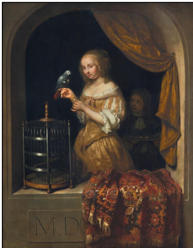
Caspar Netscher (1639-1684), Woman feeding a parrot signed and dated 'CNetscher.Ao./16.66.' (CN linked) (lowerleft) oil on panel, 18 1 / 8 x 14 5 / 8 in. (46 x 37 cm.) Estimate: $2,000,000-3,000,000

HIGHLIGHT IS CASPAR NETSCHER'S WOMAN FEEDING A PARROT