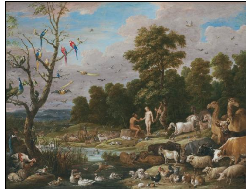
David Teniers II (1610-1690) Adam and Eve in the Garden of Eden signed 'D. TENIERS .FEC / .1679' (lower left) oil on copper 24 x 30 7/8 in. (61 x 78.4 cm.) Estimate: $200,000-300,000