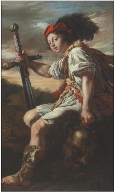
Domenico Fetti (1588/9-1623) David with the head of Goliath oil on canvas 63 ¼ x 39 in. (160.7 x 99.1 cm.) Estimate: $400,000-600,000