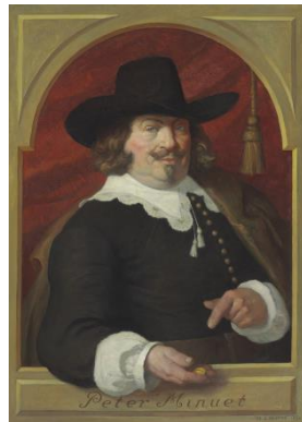
Newell Convers Wyeth (1882-1945) Peter Minuet oil on canvas Painted in 1926 Estimate: $100,000 – 150,000