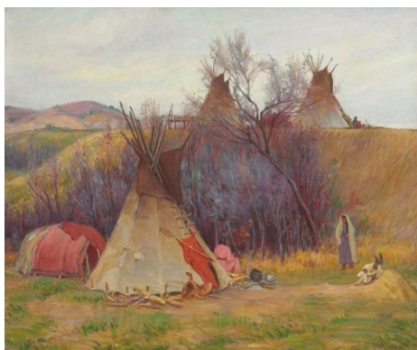
Joseph Henry Sharp (1859-1953) Cheyenne Medicine Tepee oil on canvas Painted circa 1905 Estimate: $120,000 – 180,000