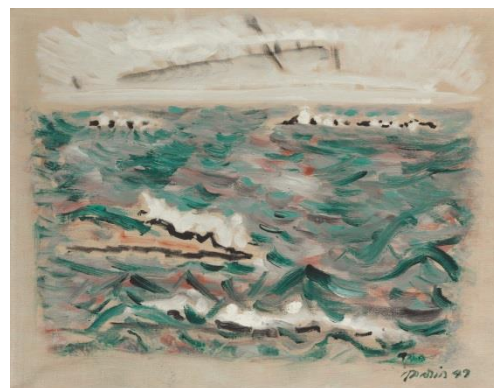
John Marin (1870-1953) Movement: Green, Red and Black oil on canvas Painted in 1947 Estimate: $80,000 – 120,000