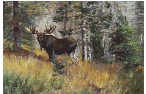
Carl Rungius (1869-1959) Moose in a Landscape oil on canvas Estimate: $80,000 – 120,000