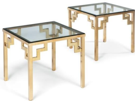
A pair of gilt-brass occasional tables, late 20 th century Purchase Price: £2,340 Selected by Mary Portas