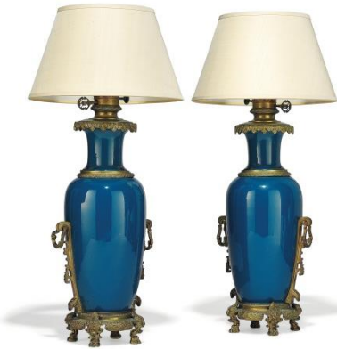
A pair of French ormolu-mounted turquoise ground porcelain lamps, late 19 th century Purchase Price: £2,700 Selected by Mary Portas