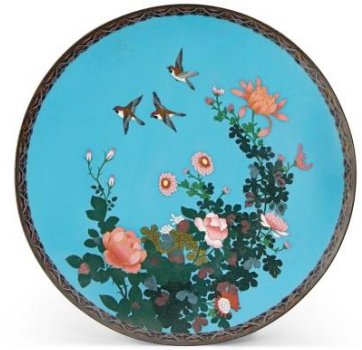
A pair of Japanese cloisonne enamel chargers, 20 th century Purchase Price: £5,200