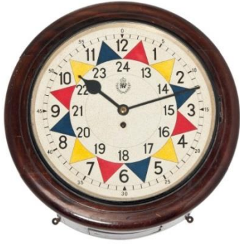
An English mahogany RAF sector clock Purchase Price: £7,800