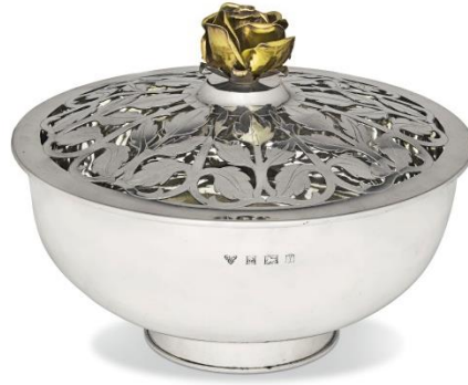
A parcel-gilt silver pot pourri bowl Purchase Price: £3,900