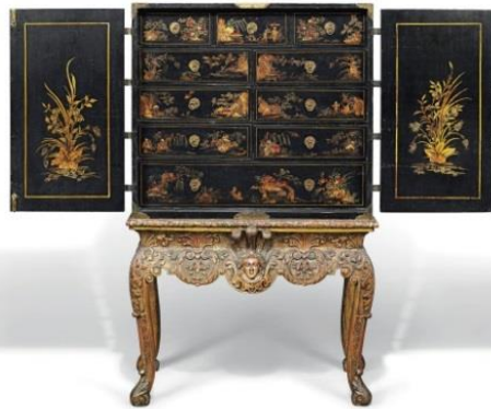
A brass-mounted, black, gilt and polychrome Japanned cabinet on stand, of George I style, late 19 th /early 20 th century Purchase Price: £6,500