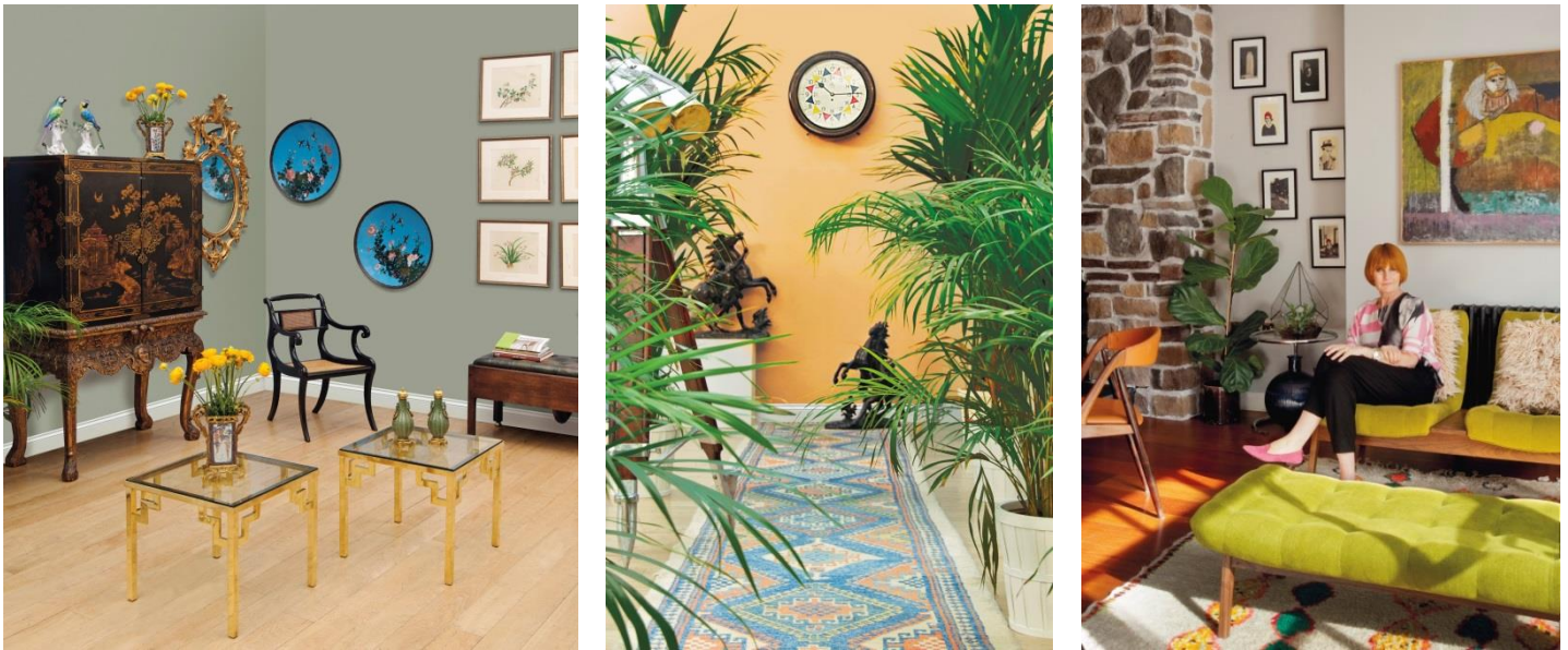
Left and centre: a selection lots from the Christie's Buy or Bid edit Right: Mary Portas at home

South Kensington – Following the introduction of Christie's Buy or Bid in November 2014, Christie's South Kensington presents another opportunity to shop for elegant objects d'art and quirky curios for the home, for a fixed price and during a fixed period. Handpicked by our specialists and Mary Portas, 'Queen of Shops', the selection of 41 unique and unusual lots allows both existing clients and those who don't usually buy at auction to experience Christie's. Acquire something different for the home, with pieces to appeal to both antique and contemporary tastes. The range includes everything from clocks and lamps, to furniture, silver and porcelain with fixed prices starting at £1,560 and ranging up to £10,400.