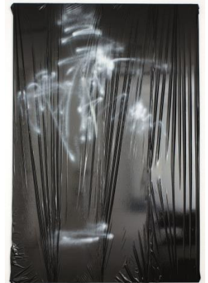
Michaela Zimmer 140801 Estimate: £4,000-6,000