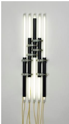
Nathaniel Rackowe SP21 Estimate: £5,000-7,000