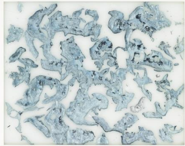
James Balmforth Phase Boundary #4 Estimate: £3,500-4,500