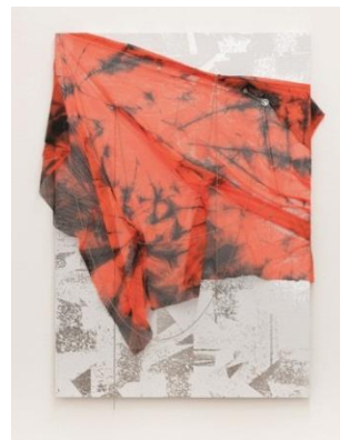
Roman Liška Untitled (Silver Dazzle Orange Mesh) Estimate: £4,000-6,000