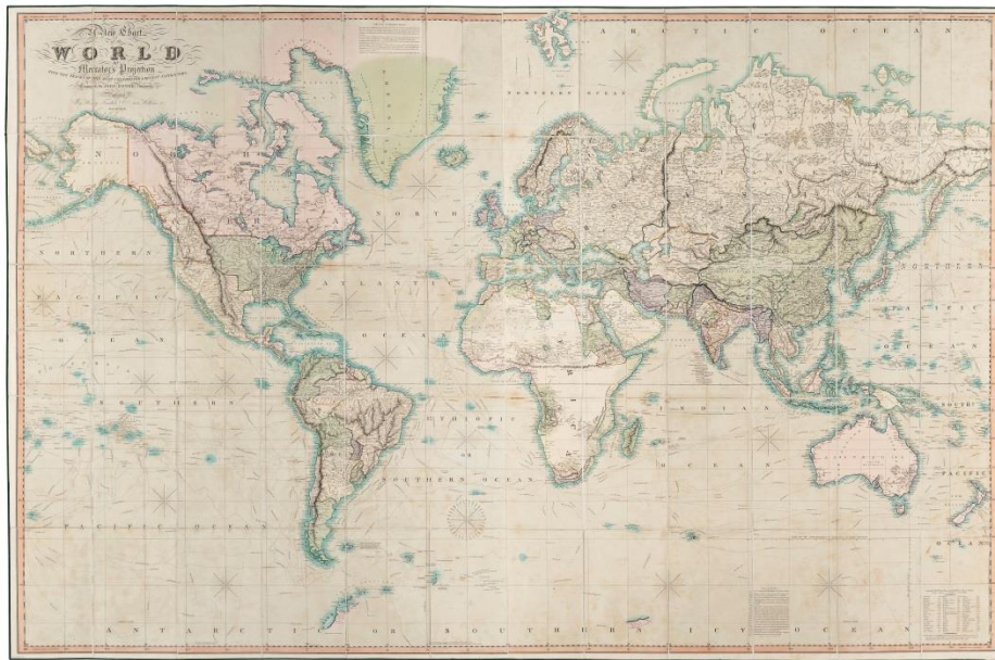
An engraved map of the world, 1838, showing central Africa as uncharted territory Estimate: £7,000-10,000

EXPLORE THE NEW THEMED SALE AT CHRISTIE'S SOUTH KENSINGTON