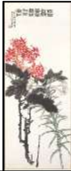
PAN TIANSHOU (1897-1971) LILIES ESTIMATE: $700,000-900,000