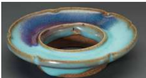
A RARE PURPLE-SPLASHED JUNYAO HEXALOBED CUP STAND CHINA, NORTHERN SONG DYNASTY (AD 960–1127) ESTIMATE: $50,000–70,000