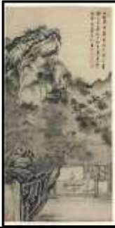
TANG YIN (1470-1524) PLAYING THE ZITHER ESTIMATE: $1,200,000-1,800,000