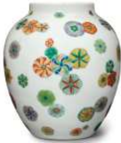
A RARE DOUCAI OVOID JAR CHINA, YONGZHENG-QIANLONG PERIOD (1723-1795) ESTIMATE: $5,000-8,000