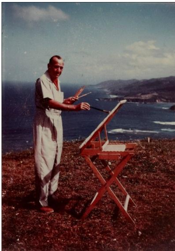
Sir Noël Coward Painting at Firefly

IN THE SALE OF MODERN BRITISH AND IRISH ART At Christie's South Kensington, 19 March 2015