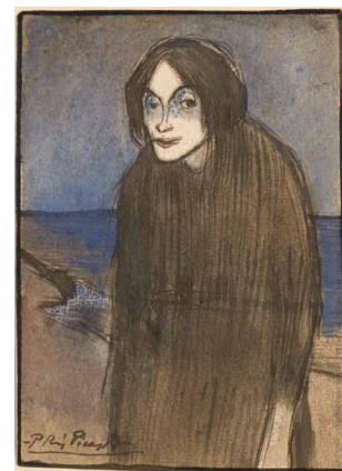
Pablo Picasso (1881-1973) La boija , 1900 Estimate: €300,000-500,000

Another highlight of the 25 March sale is the widely exhibited La boija (1900, estimate €300,000-500,000) by Pablo Picasso (1881-1973). The drawing in ink, gouache and pastel – a haunting image of a solitary woman by the seashore, her face elongated, mannerist mask of pain – is the most powerful and inspired of a group of magazine illustrations that Picasso created during spring and summer 1900, in the months leading up to his first trip to Paris and shortly after the very first solo exhibition of his career. The senior members of the Catalan modernista movement - Santiago Rusiñol, Ramon Casas and Miquel Utrillo – had offered Picasso to show in the Sala Gran of El Quatre Gats. Shortly after the closure the exhibition Picasso was ready for a bigger stage and left for Paris. To raise additional funds for the trip, he took on a range of commercial work including posters and magazine illustrations. La boija embodies this moment of youthful ambition: “Unlike the other illustrations”, John Richardson has proclaimed “this one hints at the greatness to come”. By the next fall Picasso had embarked upon the earliest major canvases of his celebrated Blue Period, whose destitute outcasts are heralded in La boija with its pervasive blue tonality and its compelling depiction of female suffering.