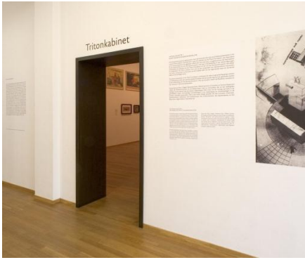
View in 2005 of the dedicated Triton room at the Gemeentemuseum, The Hague

The privately owned Triton Collection Foundation holds one of the most important collections of the 19 th and 20 th Century avant-garde art in private hands worldwide. It comprises a few hundred works from three centuries of global art from Claude Monet, Pablo Picasso, Georges Braque and Vincent Van Gogh to Yves Klein, Gerhard Richter, Ellsworth Kelly, Marina Abramovich, and Ai Weiwei.