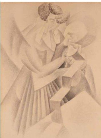
Gino Severini (1883-1966) La modiste , 1915 Estimate: €400,000-600,000