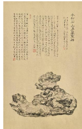
LIU DAN - Rock of the Water, Pine and Stone Retreat

Rock of the Water, Pine and Stone Retreat (illustrated top right) by Liu Dan depicts a scholar's rock at the bottom of the composition to reflect a microscopic world. Liu often states his appreciation of the scholar's object, for it enables him to connect to the wider cosmos through contemplation of its organic form. Through meticulously studying a small rock, Liu attempts to see the wider universe from a microscopic view, transforming a tangible object into an imaginary landscape prompting an inner spiritual awakening.