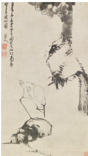
BADA SHANREN - Egret on Rock

Egret on Rock (illustrated left) by Bada Shanren is a monumental piece which comes from a private collection in Japan, and has been illustrated in various publications from as early as the 1930s. Japanese collectors highly prize the work of Bada Shanren through the belief that a Buddhism and Taoism aura emanates through his work.