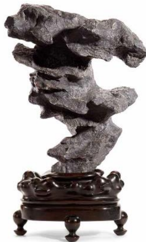
AN INSCRIBED AND DATED LINGBI CLOUD-FORM SCHOLAR'S ROCK

Assembled from a notable private collection, the present offering reflects the tradition of Chinese scholar's rocks as understood by connoisseurs and selected based on exceptional provenance. One such rock and a top highlight of the sale is a dark-grey Lingbi stone, which bears the signatures of celebrated painters Jin Nong (1687-1763) and Gao Fenghan (1683-1749).