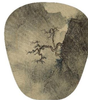
LI HUAYI - Pine Tree on a Cliff

Pine Tree on a Cliff (illustrated bottom right) by Li Huayi resembles the monumental Northern Song painting in spirit, yet the method with which the artist experiments is fundamentally a mix of old and new. To create the momentous presence, Li splashes ink onto paper, allowing it to flow freely to form the underlying composition before arduously adding realistic details using the fine brush gongbi technique. With fantastical grey and black clouds obscuring the mountainscape in a dramatic light, the resulting image is at once intimidating yet intimate, radiating a quiet energy.