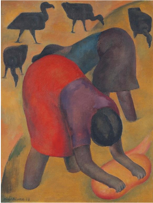
DIEGO RIVERA (MEXICAN 1886-1957) Lavanderas con zopilotes oil on canvas Painted in 1928. Estimate: $700,000 – $900,000