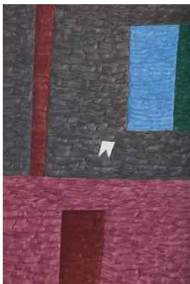
ALFREDO VOLPI (BRAZILIAN 1896-1988) Fachada (No. 1334) tempera on canvas Painted circa 1970. Estimate: $400,000 – $600,000