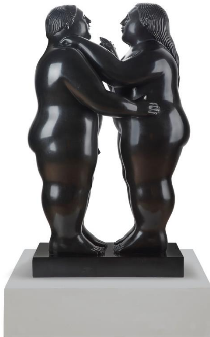
FERNANDO BOTERO (COLOMBIAN B. 1932) Dancing Couple bronze Executed in 2006; Edition two of six. Estimate: $600,000 – $800,000