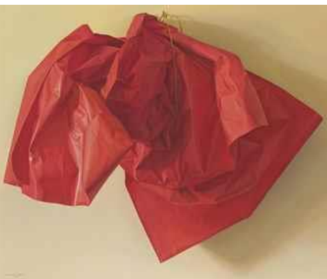
CLAUDIO BRAVO (CHILEAN 1936-2011) Red Paper oil on canvas Painted in 2005. Estimate: $500,000 – $700,000