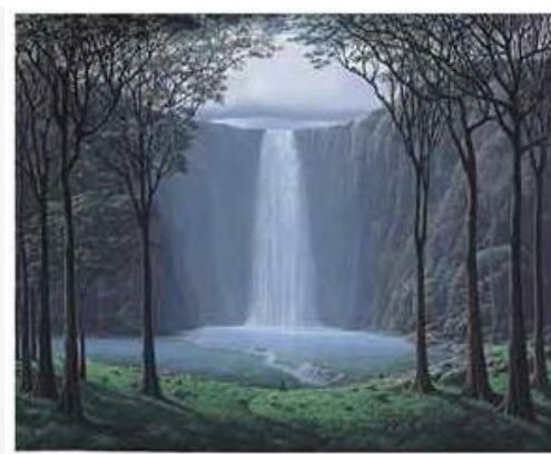
TOMÁS SÁNCHEZ (CUBAN B. 1948) Oír las aguas acrylic on canvas Painted in 1995. Estimate: $400,000 – $600,000

PRESS CONTACT: Gabriel Ford | +1 212 492 5704 | GFord@christies.com