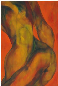
Servando Cabrera Moreno (1923-1981) Los escorpiones Painted in 1980. $60,000-80,000