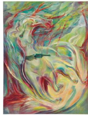
Carlos Enríquez (1900-1957) Héroe criollo Painted in 1943. $400,000-600,000