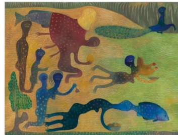
Manuel Mendive (b. 1944) Orieyeyo Painted in 2006. $40,000-60,000