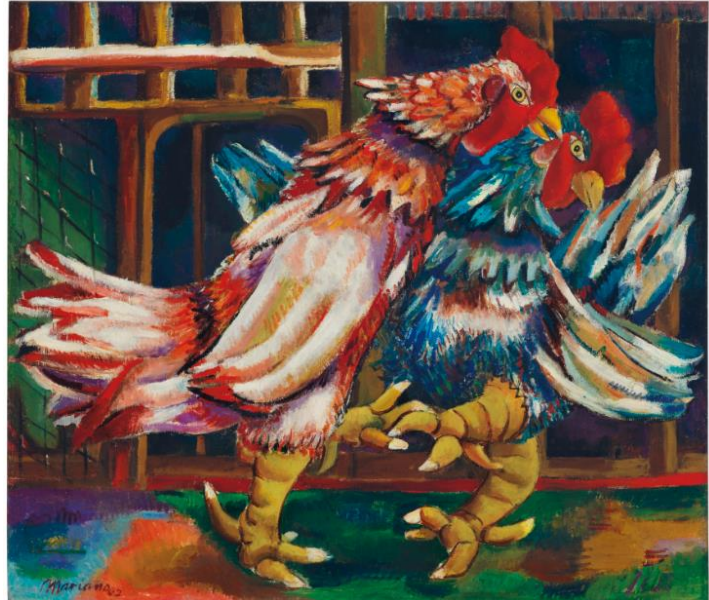
MARIANO RODRÍGUEZ (1912-1990) Pelea de gallos , Painted in 1942. Estimate: $800,000-1,200,000