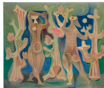
Mario Carreño (1913-1999) Mujeres y corales Painted in New York in 1945. $250,000-350,000