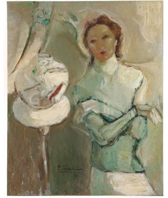
Fidelio Ponce de León (1895-1949), Joven con pecera , Painted in 1935. $90,000-120,000