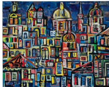
René Portocarrero (1912-1985) Paisaje de La Habana Painted in 1961. $200,000-300,000