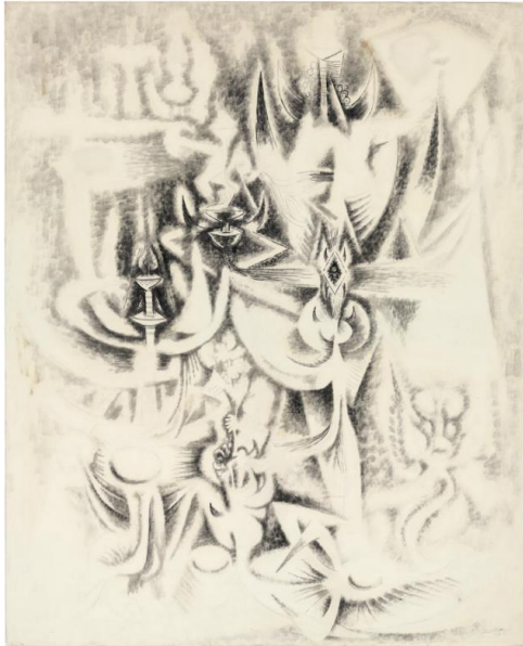
WIFREDO LAM (1902-1982) Sur les traces (Transformation) , Painted in 1945. Estimate: $2,500,000-3,500,000