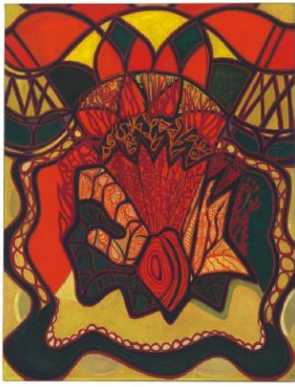
Amelia Peláez (1896-1968) Untitled Painted in 1950. $800,000-1,200,000