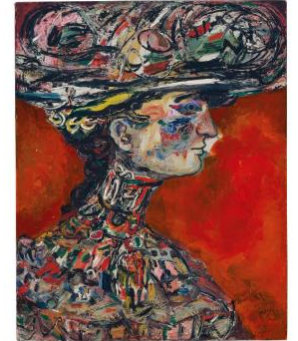
René Portocarrero (1912-1985), Retrato de Flora Painted in 1966. $100,000-200,000