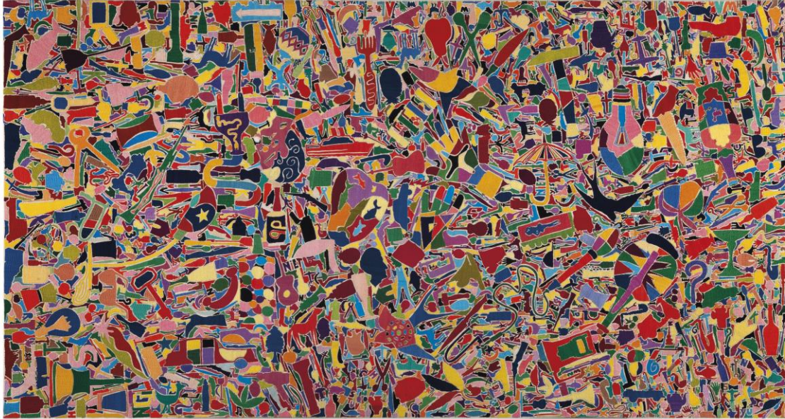
ALIGHIERO BOETTI (1940-1994)

MEDIA ALERT | LONDON FOR IMMEDIATE RELEASE: 20 September 2016