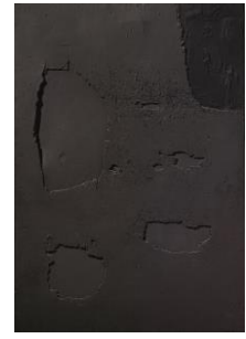
ALBERTO BURRI (1915- 1995) Nero Legno Wood, fabric and acrylic on board 166 x 115cm Executed in 1961 Estimate: £1,800,000 - £2,500,000