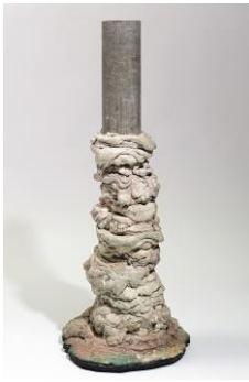
GILBERTO ZORIO (B.1944) Untitled Asbestos pipe, plaster, cobalt chloride, in three parts diameter: 60cm height: 170cm Executed in 1967 Estimate: £70,000 - £100,000