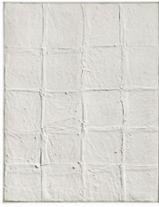
PIERO MANZONI (1933-1963) Achrome Kaolin on canvas 91 x 70cm Executed in 1959 Estimate: £600,000 - £800,000