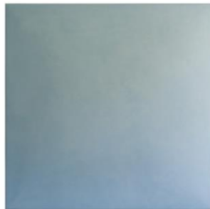
ETTORE SPALLETTI (B. 1940) Cuscino Pigment on board 150 x 150 x 12cm Executed in 1982 Estimate: £80,000 - £120,000