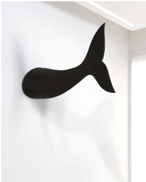
PINO PASCALI (1935-1968)