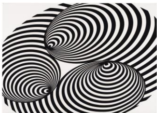
FRANCO GRIGNANI (1908-1999) Proiezione accumulata Oil on canvas 95.5 x 135.5cm Executed in 1965 Estimate: £ 25,000 - £35,000