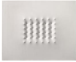
ENRICO CASTELLANI (B.1930) Superficie bianca Acrylic on canvas 80x100cm Executed in 1963 Estimate: £400,000 - £600,000