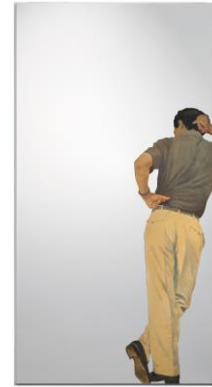
MICHELANGELO PISTOLETTO (B.1933) Uomo appoggiato Painted tissue paper on polished stainless steel, 230 x 120cm Executed in 1966 Estimate: £1,400,000 - £1,800,000