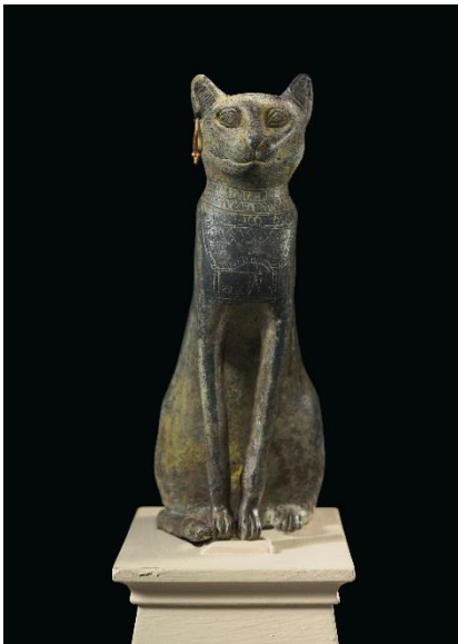
AN EGYPTIAN BRONZE CAT PTOLEMAIC PERIOD, 332-30 B.C. 5 ¾ in. (14.6 cm.) high Estimate: $30,000-50,000