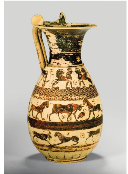
A CORINTHIAN BLACK-FIGURED OLPE CIRCA 640 B.C. 12 13/16 in. (32.5 cm.) high Estimate: $15,000-20,000

Cataloguing and complete details of the sale will be available on www.christies.com in October 2016.