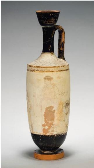
AN ATTIC WHITE-GROUND LEKYTHOS ATTRIBUTED TO THE BIRD PAINTER OR HIS WORKSHOP, CIRCA 430 B.C. 12 5/8 in. (30.8 cm.) high Estimate: $15,000-20,000