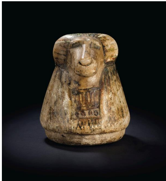
AN EGYPTIAN PAINTED ALABASTER CANOPIC JAR LID IN THE FORM OF HAPI NEW KINGDOM, 19TH DYNASTY, 1295-1186 B.C. 5 7/8 in. (4.9 cm.) high Estimate: $15,000-20,000