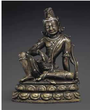
A FINE AND RARE SILVER-AND-COPPER-INLAID BRONZE FIGURE OF MAITREYA, NORTHEAST INDIA, PALA PERIOD, 12TH CENTURY, Estimate: $250,000 - $350,000; Price Realized: $341,000

The top lot for the sale was A PAINTING OF CHAKRASAMVARA AND VAJRAVARAHI at $545,000.