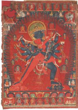
A PAINTING OF CHAKRASAMVARA AND VAJRAVARAHI, NEPAL, DATED 1513, Estimate: $200,000 - $300,000; Price Realized: $545,000