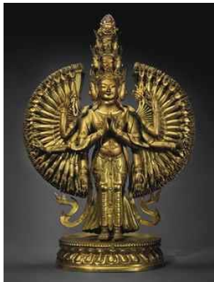
A LARGE CAST AND REPOUSSÉ GILT-BRONZE FIGURE OF ELEVEN-HEADED AVALOKITESHVARA QIANLONG PERIOD (1736-1795), Estimate: $100,000 - $150,000; Price Realized: $2,853,000