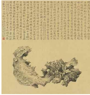
LIU DAN (BORN 1953) Tai Hu Stone Hanging scroll, ink on paper, Estimate:$50,000 – $70,000; Price Realized: $269,000