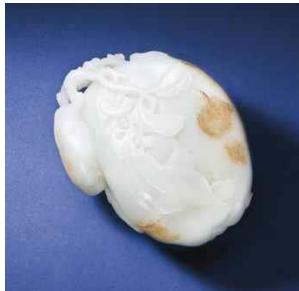
A LARGE WELL-CARVED PALE GREENISH-WHITE JADE CARVING OF QUINCE QIANLONG PERIOD (1736-1795), Estimate: $80,000 - $120,000; Price Realized: $485,000