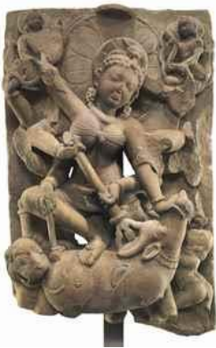
A SANDSTONE RELIEF OF DURGA MAHISHASURAMARDINI, INDIA, GUJARAPRATIHARA OR MADHYA PRADESH, LATE 8TH/EARLY 9TH CENTURY, Estimate: $80,000 - $120,000; Price Realized: $725,000

The top lot for the sale was A FINE AND RARE SILVER-AND-COPPER-INLAID BRONZE FIGURE OF MAITREYA, NORTHEAST INDIA, PALA PERIOD, 12TH CENTURY at $341,000.