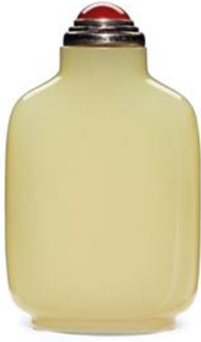
A YELLOW JADE SNUFF BOTTLE 1770-1850, Estimate: $3,000 - $5,000; Price Realized: $62,500