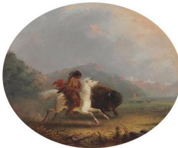
PROPERTY FROM AN IMPORTANT BALTIMORE COLLECTION Alfred Jacob Miller (1810-1874) Pawnee Running a Buffalo oil on canvas, 20 x 24 in., oval Painted in 1854. Estimate: $1,000,000-1,500,000