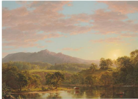
Frederic Edwin Church (1826-1900) A New England Lake oil on canvas, 30 x 42 in. Painted in 1854. Estimate: $3,500,000-5,500,000