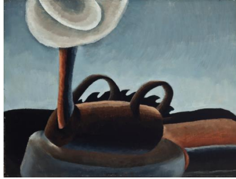
Arthur G. Dove (1880-1946) Abstract of a Threshing Engine Sawing Wood II oil on board, 15 1/8 x 20 in. Painted in 1931. Estimate: $1,200,000-1,800,000