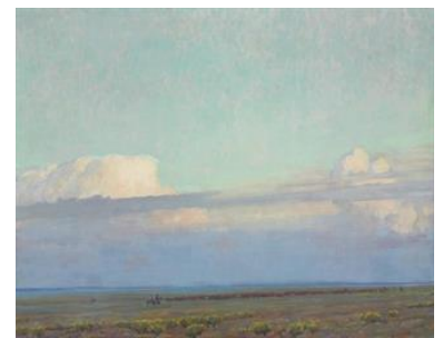
PROPERTY OF A DISTINGUISHED LADY AND GENTLEMAN Maynard Dixon (1875-1946) The Prairie oil on canvas, 62 x 78 in. Painted in 1915 Estimate: $600,000-800,000