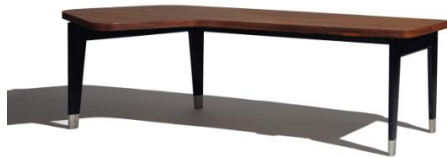
JEAN PROUVE (1901-1984) A 'PRESIDENCE N°201' DESK, DESIGNED 1948 this example realized circa 1953, painted and chromed metal, Formica Estimate: $120,000-180,000