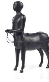
FRANCOIS-XAVIER LALANNE (1927-2008) 'CENTAURE ATTELE (PETIT)', DESIGNED 1985 patinated bronze Estimate: $60,000-80,000