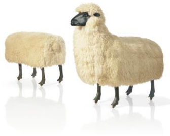
FRANCOIS-XAVIER LALANNE (1927-2008) 'MOUTONS DE LAINE', A SHEEP AND OTTOMAN, 1968 wool, patinated aluminum, wood Estimate: $400,000 – $600,000