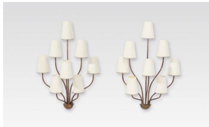
JEAN ROYERE (1902-1981) A PAIR OF EIGHT-LIGHT 'PERSANE' APPLIQUES, CIRCA 1950 painted and gilt-metal Estimate: $60,000-80,000