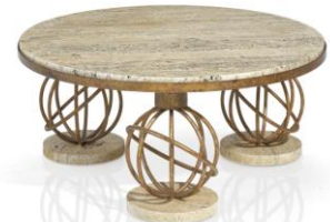
JEAN ROYERE (1902-1981) A 'SPHERE' LOW TABLE, 1950S gilt wrought-iron, travertine Estimate: $40,000-60,000