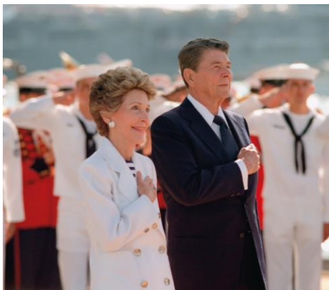
President Reagan and Nancy Reagan on the USS Iowa in New York Harbor. July 4, 1986.