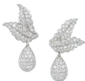
A PAIR OF DIAMOND AND PLATINUM EAR PENDANTS Clips signed V.C.A. for Van Cleef & Arpels Estimate: $5,000-7,000