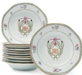
A SET OF TEN CHINESE EXPORT INITIALED SOUP PLATES, AND A PAIR OF SIMILAR PLATES CIRCA 1780-95 Estimate: $4,000-6,000