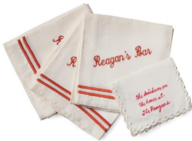
THE REAGAN'S BAR A GROUP OF BAR NAPKINS SECOND HALF 20TH CENTURY Estimate: $200-400