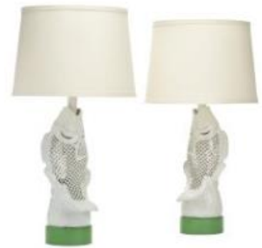
A PAIR OF WHITE PORCELAIN FISH-FORM LAMPS , 20TH CENTURY SUPPLIED BY WILLIAM (BILLY) HAINES INC., CIRCA 1970-1985 Estimate: $2,000-3,000