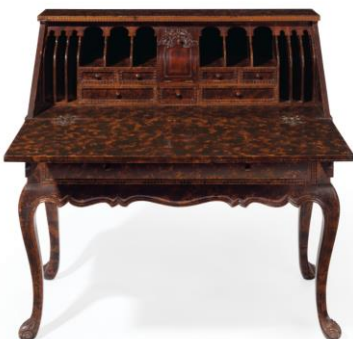
PRESIDENT RONALD REAGAN 'THE GOVERNOR'S DESK' AN AMERICAN SCUMBLE-PAINTED SLANT FRONT DESK BY DON GUSTAFSON, 1971 Estimate: $4,000-6,000