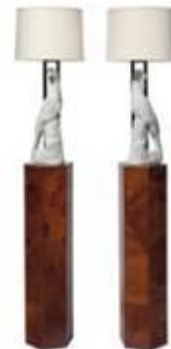
A PAIR OF CHINESE EXPORT PORCELAIN 'PHEASANT' STANDING LAMPS 20TH CENTURY, SUPPLIED BY TED GRABER, INC., CIRCA 1988 Estimate: $5,000-8,000

Formerly in The Family Residence, the White House, Washington D.C.