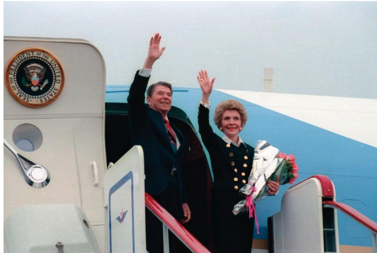
The Reagans leaving after the Moscow Summit. June 2, 1988.

SOLD TO BENEFIT THE RONALD REAGAN PRESIDENTIAL FOUNDATION & INSTITUTE