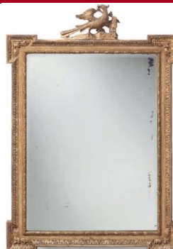
A GEORGE III GILTWOOD PICTURE FRAME MIRROR, LATE 18TH CENTURY AND LATER Estimate: $2,000-3,000

A gift to Governor Ronald Reagan to commemorate his second term as Governor of California.