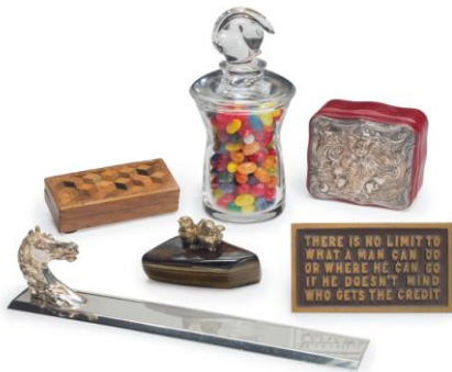
PRESIDENT RONALD REAGAN A COLLECTION OF ACCESSORIES FROM THE PRESIDENT'S DESK, 20TH CENTURY Estimate: $1,000-2,000