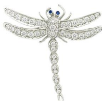
TIFFANY & CO. DIAMOND DRAGONFLY BROOCH Estimate: $2,000-3,000