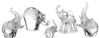
A COLLECTION OF FIVE GLASS MODELS OF ELEPHANTS, 20TH CENTURY TWO ETCHED STEUBEN Estimate: $800-1,200

PROVENANCE: Formerly in The Family Residence, the White House, Washington D.C.