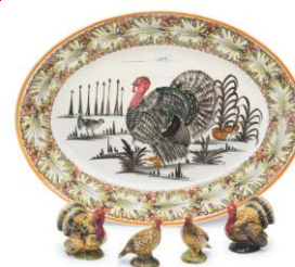
THE REAGAN FAMILY 'THANKSGIVING' PLATTER AN ITALIAN CERAMIC TURKEY PLATTER AND TWO SETS OF TURKEY-FORM CASTERS 20TH CENTURY Estimate: $500-1,000

PROVENANCE: Formerly in The Family Residence, the White House, Washington D.C.