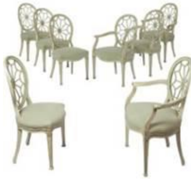
A SET OF EIGHT GEORGE III STYLE WHITE AND GREEN-PAINTED DINING CHAIRS SUPPLIED BY TED GRABER, INC., CIRCA 1988 Estimate: $4,000-6,000