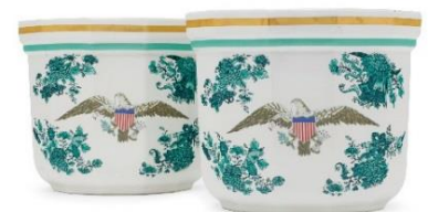
A PRIVATE COMMISSION TO COMMEMORATE THE INAUGURATION OF PRESIDENT RONALD REAGAN -A PAIR OF MOTTAAHEDEH CHINESE EXPORT-STYLE PORCELAIN ICE PAILS, MODERN, BLACK PRINTED AND IMPRESSED MARKS Estimate: $2,000-4,000

A gift to President and Mrs. Ronald Reagan from Mstislav and Galina Rostropovich.