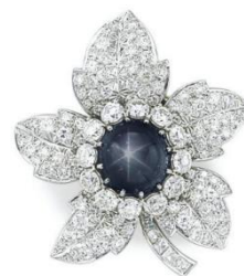
A BLACK STAR SAPPHIRE AND DIAMOND BROOCH Estimate: $3,000-5,000