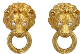
A PAIR OF DIAMOND AND GOLD EAR CLIPS BY VAN CLEEF & ARPELS Estimate: $15,000-20,000