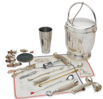
PRESIDENT AND MRS. RONALD REAGAN A COLLECTION OF BAR ACCESSORIES 20TH CENTURY Estimate: $1,000-2,000