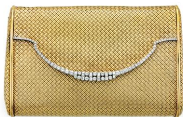
A GOLD AND DIAMOND EVENING BAG Estimate: $10,000-15,000