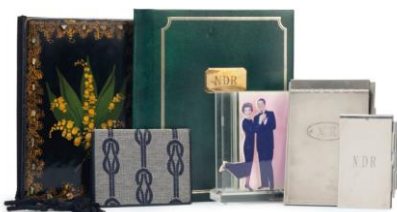
MRS. RONALD REAGAN A COLLECTION OF PERSONALIZED DESK ACCESSORIES, 19TH/20TH CENTURY Estimate: $500-1,000