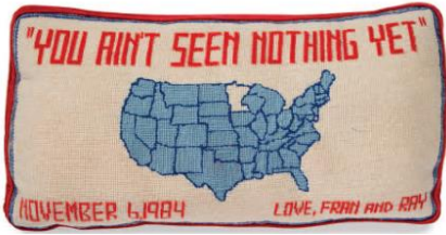
A NEEDLEPOINT CUSHION CIRCA 1984 Estimate: $1,000-1,500