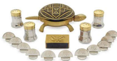
A COLLECTION OF DINING ROOM ACCESSORIES, 20TH CENTURY Estimate: $200-400

PROVENANCE: Formerly in The Family Residence, the White House, Washington D.C.