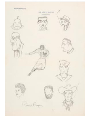
PRESIDENT RONALD REAGAN A SERIES OF PENCIL SKETCHES SIGNED "RONALD REAGAN" [WATERMARKED 1982] ON WHITE HOUSE STATIONERY Estimate: $2,500-3,500

An Inauguration gift from Mr. and Mrs. Frank Sinatra. January 20, 1981.