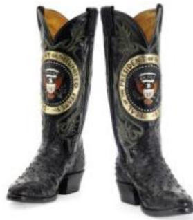
PRESIDENT RONALD REAGAN'S COWBOY BOOTS, BY TONY LAMA BOOTS, CIRCA 1980 Estimate: $10,000 – 20,000

A gift to President Ronald Reagan from Mr. and Mrs. Ray Stark.