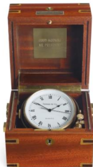
'GOOD MORNING MR. PRESIDENT' AN INAUGURATION GIFT TO PRESIDENT RONALD REAGAN FROM MR. AND MRS. FRANCIS SINATRA A MARINE CHRONOMETER TIFFANY & CO., CIRCA 1981 Estimate: $5,000-10,000

Formerly in The Family Residence, the White House, Washington D.C.