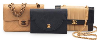
CHANEL, BLACK AND CREAM LAMBSKIN LEATHER BAG, NAVY CANVAS QUILTED CLUTCH BAG AND LIGHT BROWN LEATHER BAG, 20TH CENTURY Estimate: $500-700