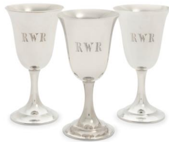
PRESIDENT RONALD REAGAN A SET OF SIXTEEN AMERICAN SILVER GOBLETS MARK OF INTERNATIONAL STERLING CO., MERIDEN, 20TH CENTURY Estimate: $1,000-1,500