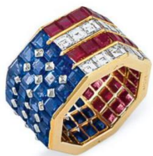
A DIAMOND, SAPPHIRE AND RUBY RING, BY BULGARI Estimate: $5,000-8,000