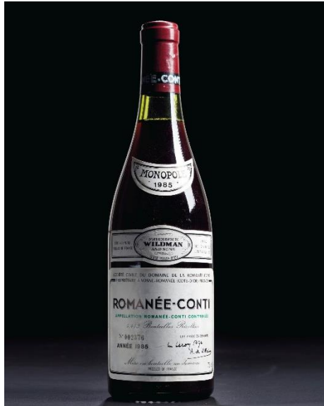
Domaine de la Romanée-Conti, Romanée-Conti 1985