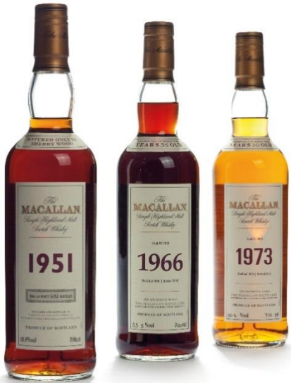
The Macallan, Fine And Rare Collection, 50 Year Old 1951