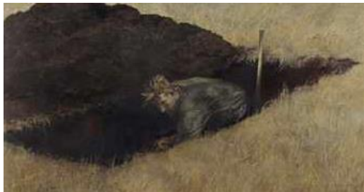
Andrew Wyeth (1917-2009) The Sexton tempera on panel Painted in 1950. Estimate: $2,000,000-3,000,000