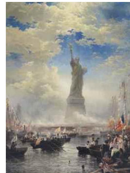
Edward Moran (1829-1901) Commerce of Nations Rendering Homage to Liberty oil on canvas Painted in 1876. Estimate: $700,000-1,000,000