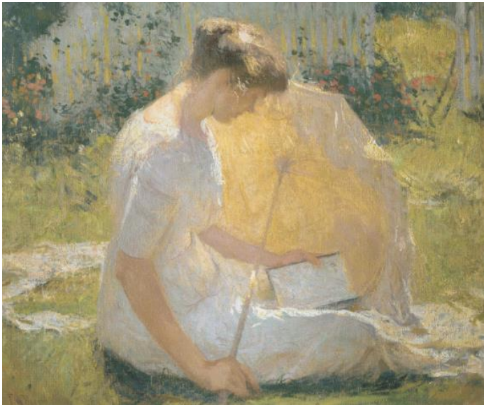
Frank Weston Benson (1862-1951) The Reader oil on canvas Painted in 1906. Estimate: $2,500,000 – 3,500,000