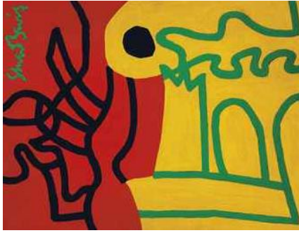
Stuart Davis (1892-1964) Twilight in Turkey oil on canvas Painted in 1961. Estimate: $600,000 - 900,000