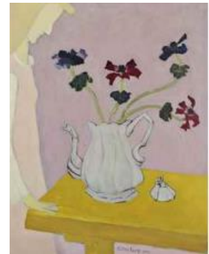
Milton Avery (1885-1965) Anemones oil and pencil on canvas Painted in 1945. Estimate: $400,000 – 600,000