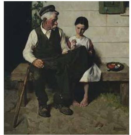
Norman Rockwell (1894-1978) The Lighthouse Keeper's Daughter oil on canvas Painted in 1923. Estimate: $400,000 – 600,000