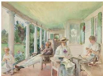
John Singer Sargent (1856-1925) The Piazza; On the Verandah watercolor and charcoal on paper 15 ½ x 21 in. (39.4 x 53.3 cm.) Executed circa 1921-22. Estimate: $700,000-1,000,000