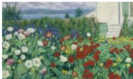
John Leslie Breck (1860-1899) Garden, Ironbound Island, Maine oil on canvas Painted circa 1896. Estimate: $700,000 – 1,000,000