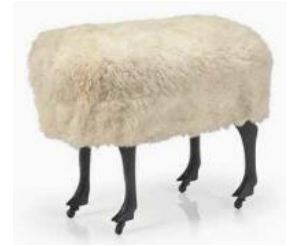
FRANCOIS-XAVIER LALANNE (1927-2008) A 'MOUTON DE LAINE' OTTOMAN, 2012 $100,000-150,000