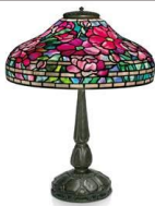
TIFFANY STUDIOS A 'PEONY' LAMP, CIRCA 1910 $50,000-70,000