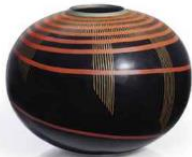
JEAN DUNAND (1877-1942) A SPHERICAL VASE, CIRCA 1925 $80,000-120,000