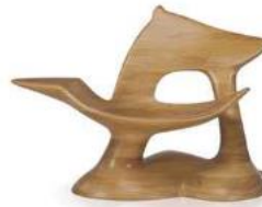
WENDELL CASTLE (B. 1932) A 'SONNY BOY' CHAIR, 2009 $50,000-80,000