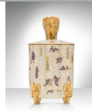
GIO PONTI (1891- 1979) LA CONVERSAZIONE CLASSICA, A VASE AND COVER, 1924 $50,000-70,000