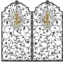
EDGAR BRANDT (1880-1960) 'DIANE ET LA BICHE', A PAIR OF GATES, CIRCA 1926-1927 $80,000- 120,000