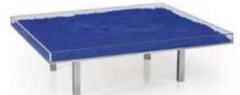
YVES KLEIN (1928-1962) 'TABLE BLEUE', DESIGNED 1961 $20,000-30,000