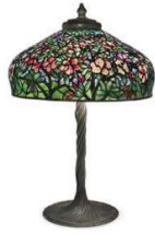
TIFFANY STUDIOS A RARE 'AZALEA' TABLE LAMP, CIRCA 1910 $150,000-200,000