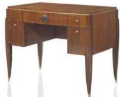
EMILE-JACQUES RUHLMANN (1879-1933) A LADY'S DESK, CIRCA 1928 $60,000-80,000