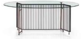
MATHIEU MATEGOT (1910-2001) A DINING TABLE, CIRCA 1958 $40,000-60,000