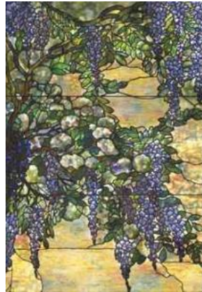
TIFFANY STUDIOS A 'SNOWBALL AND WISTERIA' WINDOW, CIRCA 1902 Estimate: $200,000-300,000