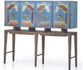
GIO PONTI (1891-1979) A UNIQUE AND IMPORTANT CABINET, CIRCA 1939 Estimate: $80,000-120,000