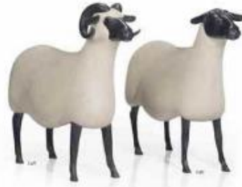
FRANCOIS-XAVIER LALANNE (1927-2008) A 'BELIER' FROM THE 'NOUVEAUX MOUTONS' SERIES, 2004 Estimate: $100,000-150,000