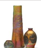
TIFFANY STUDIOS FAVRILE GLASS VASES $1,000-6,000