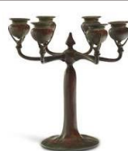
TIFFANY STUDIOS A BRONZE CANDELABRUM, CIRCA 1910 $2,500-3,500