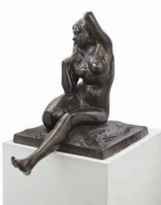
REMBRANDT BUGATTI (1884-1916) 'JEUNESSE', A UNIQUE SCULPTURE, 1906 Estimate: $400,000-600,000