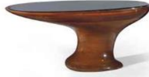
PIETRO CHIESA (1892-1948) A RARE LOW TABLE, CIRCA 1940 $70,000-100,000