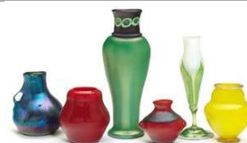
TIFFANY STUDIOS FAVRILE GLASS VASES $1,500-3,500