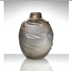
CARLO SCARPA (1906- 1978), A CORROSO VASE, MODEL 3695, 1936 $50,000 - 70,000