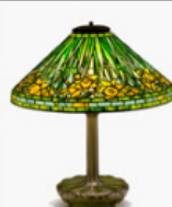
TIFFANY STUDIOS, A 'DAFFODIL' LAMP, CIRCA 1905 $25,000-35,000