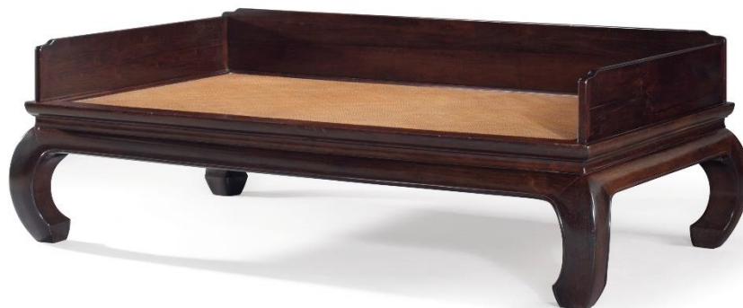
An Important Zitan Luohan Bed, Luohanchuang , 18 th Century (estimate: $2,000,000-3,000,000)

The Virata family focused on works with distinguished provenance, superior condition and esteemed publication history. Many of the furniture pieces have appeared in major international exhibitions of Asian art, and previously belonged to important collectors and scholars in the field. Highlights include a pair of very rare 17 th century huanghuali 'southern official's hat' armchairs (estimate: $600,000- 800,000), which come from the collection of Gustave Ecke, and appears in the groundbreaking 1944 book Chinese Domestic Furniture , as does a huanghuali lamp stand (estimate: $120,000-180,000), formerly of the famed Pan-Asian collection; a very rare huanghuali kang table dating the Wanli period (1572-1620) (estimate: $500,000-700,000); a rare pair of zitan 'official's hat' armchairs, sichtuguanmaoyi (estimate: $800,000-1,200,000); and an important zitan luohan bed, luohanchuang , 18 th century (estimate: $2,000,000-3,000,000).