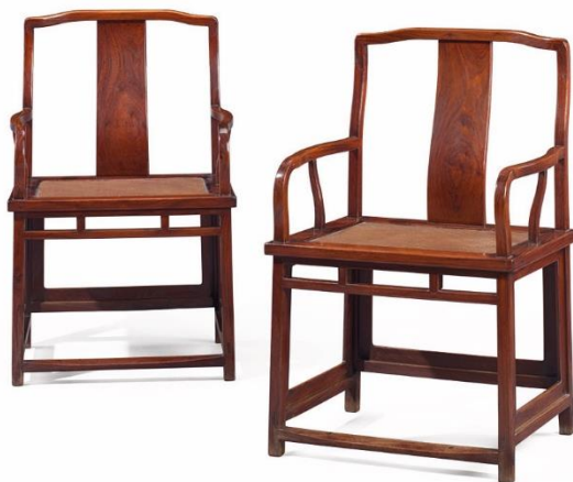
The 'Ecke Chairs', A Very Rare Pair of Huanghuali 'Southern Official's Hat' Armchairs, 17 th Century (estimate: $600,000-800,000)

Additional highlights demonstrating the range of objects on offer in this sale include Sunrise Over Water , a hanging scroll by Qi Baishi (1864-1957) (estimate: $500,000-700,000); a Flambé-Glazed Vase , Qianlong mark and of the period (1736-1795) (estimate: $30,000-50,000); a 'Goloubew' Five-Medallion daybed cover carpet, Ningxia, North China, Kangxi Period (1662-1722) (estimate: $20,000-30,000); and an Imperial Yellow-Glazed Cup, Yongzheng Mark and of the period (1723-1735) (estimate: $30,000-50,000).