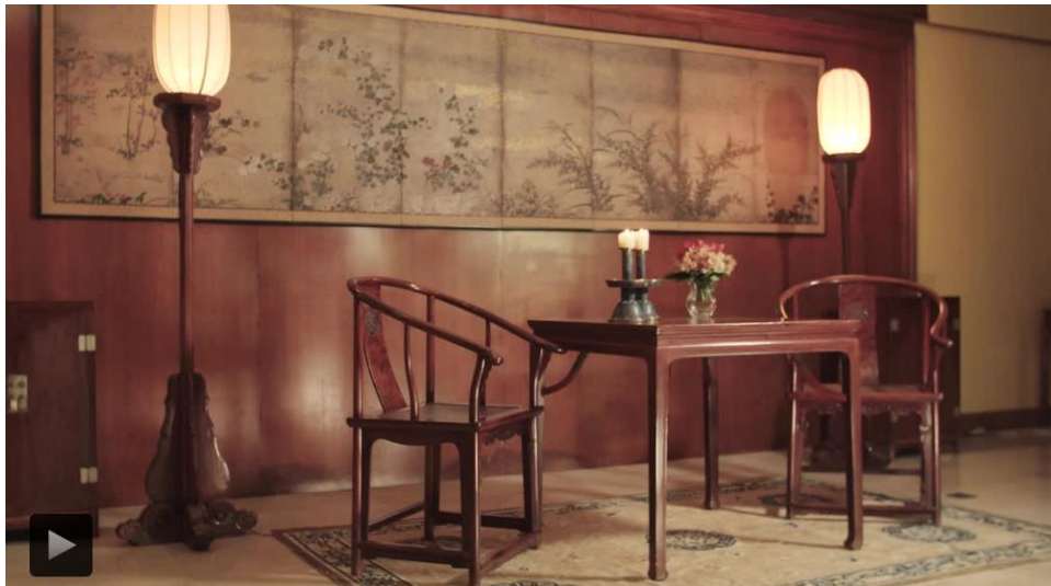
Video: 'A benchmark of quality and refinement' — the Virata Collection