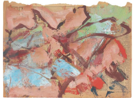
Willem de Kooning (1904-1997) Untitled oil on newspaper 11 1/2 x 15 in. (29.2 x 38.1 cm.) Executed circa 1976. Estimate: $30,000-50,000