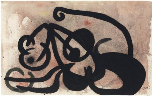
Joan Miró (1893-1983) Chien I Watercolor, pastel and brush and black ink on paper 18 1/4 x 29 3/8 in. (46.5 x 74.6 cm.) Executed on 10 November-22 December 1972 Estimate: $200,000-300,000