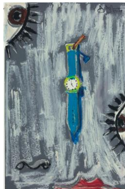
Jasper Johns (B. 1930) Untitled pigment stick over intaglio 24 1/4 x 17 in. (61.5 x 43.1 cm.) Executed in 1987 and 2008. Estimate: $300,000-500,000