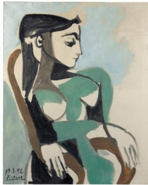
Pablo Picasso (1881-1973) Femme dans un fauteuil Oil on canvas 39 1/2 x 31 1/2 in. Painted in Cannes, 19 April 1956 Estimate: $5,000,000-7,000,000