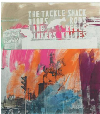
Robert Rauschenberg (1925-2008) Untitled acrylic on fabric-laminated paper mounted on canvas 31 1/2 x 28 in. (80 x 71.1 cm.) Executed in 1985. $150,000-250,000