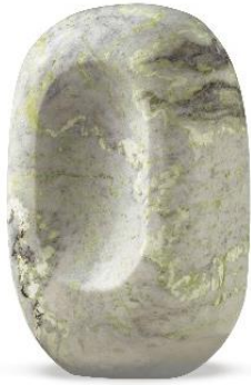
Barbara Hepworth (1903-1975) Green Head Irish green marble Height: 10 5/8 in. 27.1 cm.) Executed in 1970 Estimate: $500,000-800,000