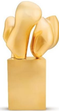
Jean (Hans) Arp (1886-1966) Echo de torse Polished bronze Height: 13 in. (33.1 cm.) Conceived in 1961; this bronze version cast in 1964 Estimate: $100,000-150,000