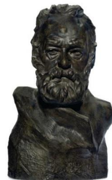
Auguste Rodin (1840-1917) Buste de Victor Hugo dit, a l'illustre maître Bronze with brown and green patina Height: 21 in. (53.4 cm.) Conceived in 1883; this bronze version cast in 1955 Estimate: $70,000-100,000