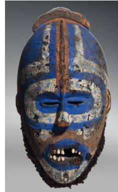
A GREBO MASK Maryland County, Area of Nyaake, Liberia wood with pigment, human teeth and hair Height: 20 in. (50.8 cm.) Estimate: $250,000-350,000