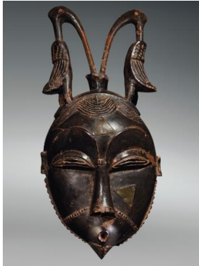
THE BÉDIAT-HUSTON BAULE MASK Ivory Coast wood and copper alloy Height: 12 ½ in. (31.7 cm.) Estimate: $500,000-800,000