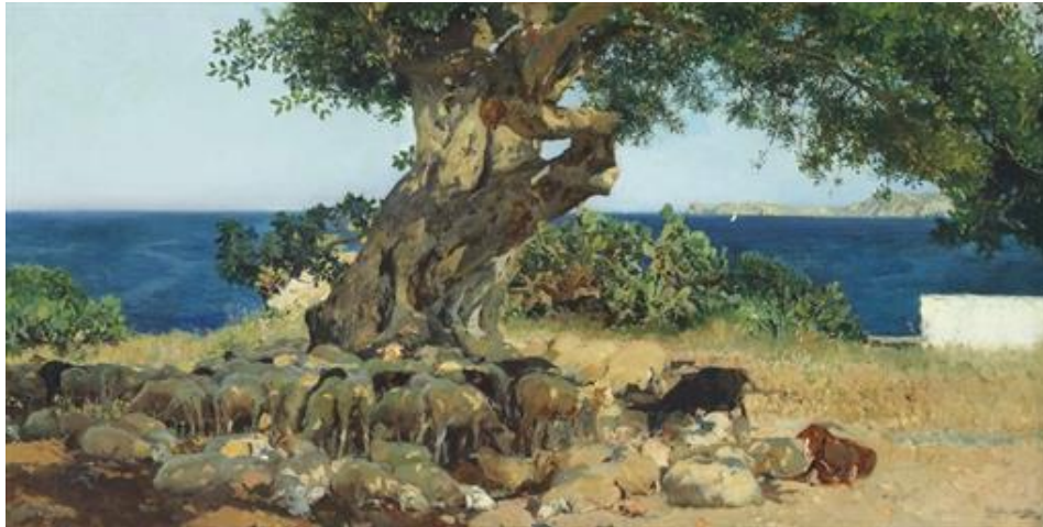
Joaquín Sorolla y Bastida (Spanish, 1863-1923), Algarrobo (The Carob Tree) , oil on canvas. Estimate: $700,000 - 1,000,000

New York – Christie's announces the sale of 19 th Century European Art on May 23, which offers a strong selection of fresh to the market paintings, drawings, and sculpture by leading artists who reflect the extraordinary diversity of this pivotal period of art history. Painters of the Barbizon, French Realist and Orientalist schools are represented, as well as a strong selection of Belle Époque painters and important female artists. The tightly curated sale of 88 lots is primarily sourced from private collections with lots ranging in price from $7,000 to $1,200,000.