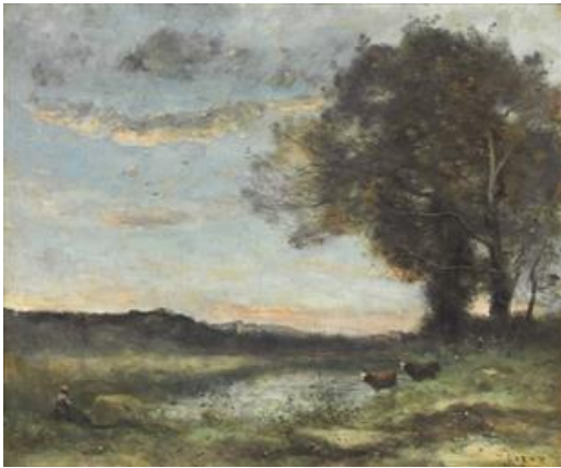
Jean-Baptiste-Camille Corot (French, 1796-1875) Groupe d'arbres au bord d'un marais, avec deux vaches (Soleil levant) Estimate: $100,000 - 150,000