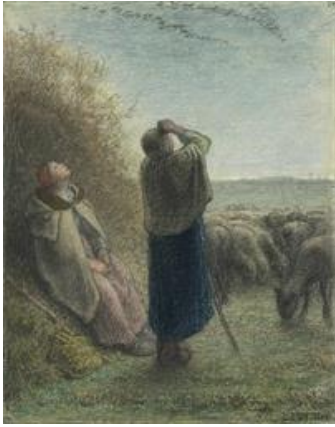
Jean-François Millet (French, 1814-1875) Le Passage des oies sauvages Estimate: $600,000 - 800,000