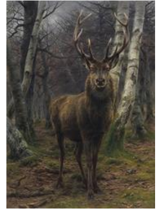
Rosa Bonheur (FRENCH, 1822-1899) Le Roi de la forêt Estimate: $800,000 - 1,200,000