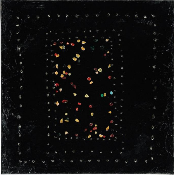
LUCIO FONTANA Concetto spaziale, In piazza San Marco di notte con Teresita (1961) acrylic and stones on canvas 59 x 59 in. (150 x 150 cm.), Estimate on request 'Thinking Italian' (6 October)