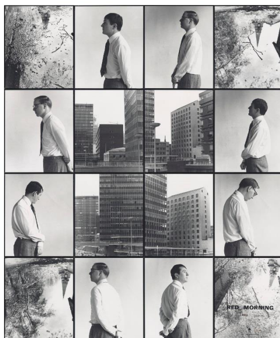
Gilbert & George Red Morning (Hell) (1977) Gelatin silver prints, in 16 parts 95 x 78 in. (241.3 x 198.1 cm.) £800,000 – £1,200,000

Masterpieces of Design and Photography (3 October)