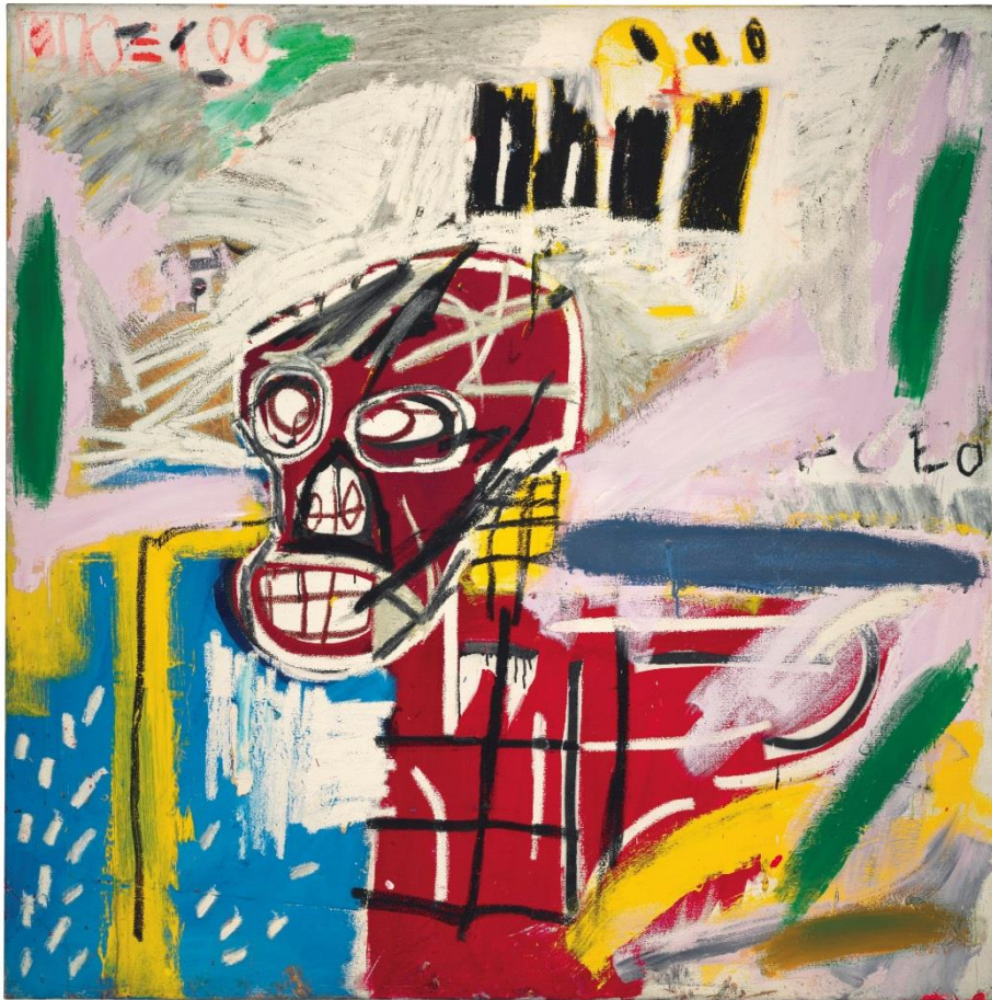
Jean-Michel Basquiat: Red Skull (1982) Acrylic, oilstick and paper collage on canvas, 60 x 60 in. (152.4 x 152.4 cm.) Estimate on request Post-War and Contemporary Art Evening Auction (6 October)

London - This October during London's Frieze Week, Christie's will present a second major season of Post-War and Contemporary Art in 2017 at King Street, bringing together the very best in art and design across the 20th and 21st centuries. Following the successful move of the London auctions in March this year, Christie's sales this October demonstrate a diversity that reflects the breadth and depth of taste across the international collecting community. Christie's innovative programme will bring together five auctions and one exhibition, which will showcase the highest quality in not only painting, drawing and sculpture but also design and photography. On view at Christie's King Street, London, from the 29 September; a selection of highlights will be on view in New York, Rockefeller Center from 8 to 12 September and Hong Kong from 18 to 21 September.