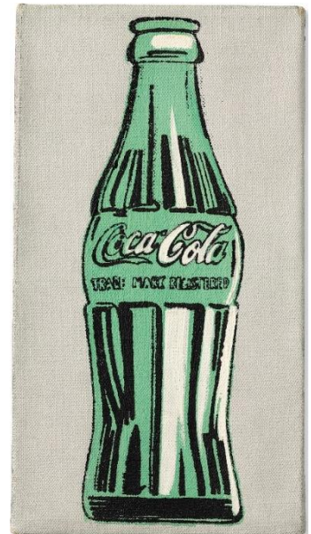
ANDY WARHOL Coke Bottle (1962) silkscreen ink, acrylic and ballpoint pen on canvas 11 1/8 x 6 in. (28.3 x 15.2cm.) Estimate: £1,800,000 – 2,500,000 'Up Close' (3 October)

Andy Warhol's seminal Coke Bottle will lead 'Up Close', a specially curated evening auction that will take place 3 October 2017, during London's Frieze week. The auction will bring together an exceptional group of works to shed light on how artists, including Twombly and Warhol, have turned to small-scale compositions to challenge