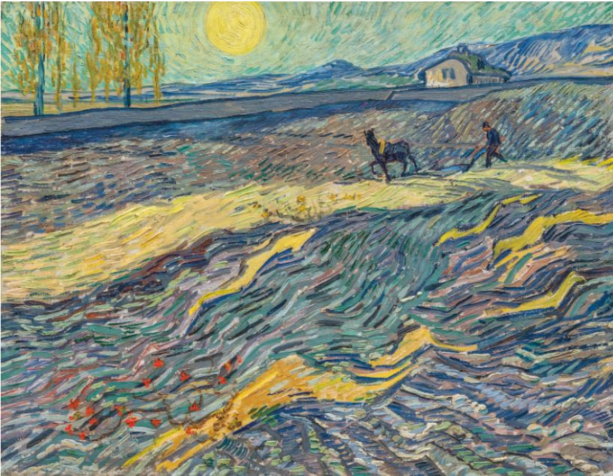
Vincent Van Gogh (1853-1890), Laboureur dans un champ , oil on canvas, 1889. Estimate on Request