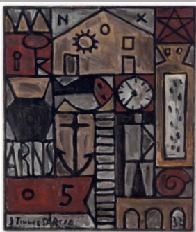
JOAQUÍN TORRES-GARCÍA (1874-1949) Composición constructiva Oil on canvas. Painted in 1932. $700,000-900,000