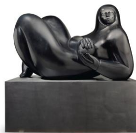
JORGE JIMÉNEZ DEREDIA (B. 1954) Crepúsculo Bronze. Executed in 2008. $300,000-400,000