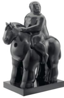
FERNANDO BOTERO (B. 1932) Man on a Horse Bronze. $500,000-700,000