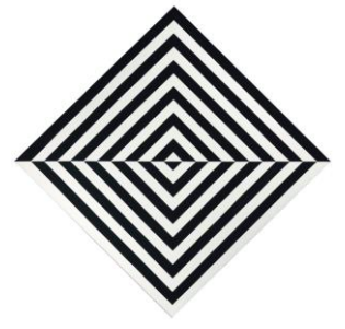
CARMEN HERRERA (B. 1915) Diagonal Oil and acrylic on canvas. Painted in 1987, after a lost work from 1952. $500,000-700,000