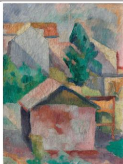
DIEGO RIVERA (1886-1957) Paisaje Oil on canvas. Painted circa 1919. $150,000-200,000