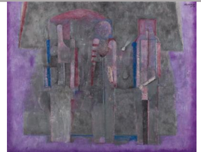
RUFINO TAMAYO (1899-1991) Tres personajes en un interior Oil and sand on canvas. Painted in 1970. $600,000-800,000