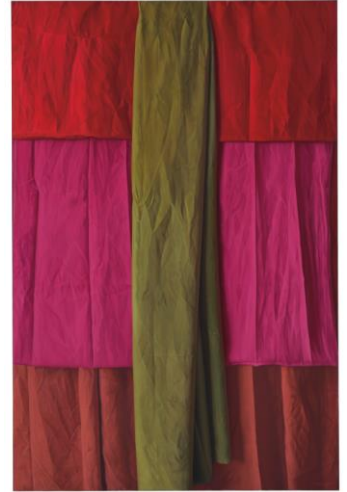
LEFT: ALFREDO RAMOS MARTÍNEZ (1871-1946), MUJER CON FLORES , OIL ON CANVAS, PAINTED CIRCA 1932. ESTIMATE: $800,000-1,200,000 CENTER: FERNANDO BOTERO (B. 1932), THE HOUSE , OIL ON CANVAS, PAINTED IN 1995. ESTIMATE: $800,000-1,200,000 RIGHT: CLAUDIO BRAVO (1936-2011), LUX PERPETUA (3 REDS AND GREEN) , OIL ON CANVAS, PAINTED IN 1999. ESTIMATE: $900,000-1,500,000