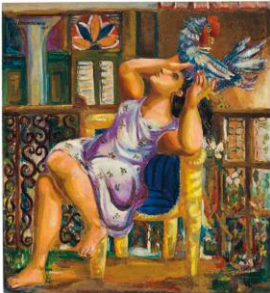
CUBA MODERNA: Masterworks from a Private Collection MARIANO RODRÍGUEZ (1912-1990) Mujer con gallo Oil on canvas. Painted in 1941. $250,000-350,000