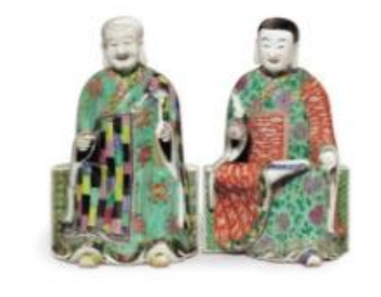
PROPERTY FROM A DISTINGUISHED PRIVATE COLLECTION A LARGE PAIR OF FAMILLE ROSE SEATED LUOHAN LATE 18TH/EARLY 19TH CENTURY $40,000 - 60,000