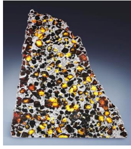
LARGE PARTIAL SLICE OF ESQUEL PALLASITE — EXTRATERRE STRIAL GEMS Pallasite – PAL Chubut, Argentina Estimate: $25,000 - 35,000