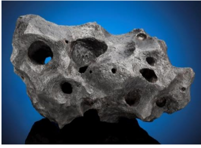
MATCHLESS CANYON DIABLO METEORITE — NATURAL SCULPTURE FROM OUTER SPACE Iron – Coarse octahedrite IAB-MG Meteor Crater, Coconino County, Arizona (35°3' N, 111°2' W) Estimate: $150,000 - 250,000