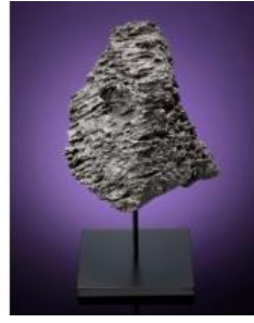
DRONINIO METEORITE — NATURAL TABELTOP SCULPTURE FROM OUTER SPACE Iron, ataxite (ungrouped) Ryazan district, Russia Estimate: $6,000 - 35,000