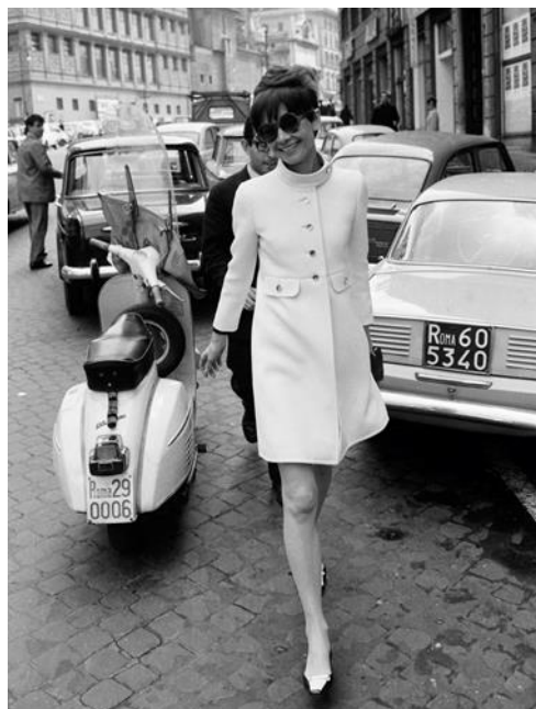
Audrey Hepburn, Rome, March 1968

London – Christie's online sale Audrey Hepburn: The Personal Collection Part III will open for bidding on 2 May, closing on 9 May, 2018. Comprising 212 lots, the sale is now available to view online www.christies.com/audreyhepburn . Following the success of Part I and II in Autumn 2017, Part III continues Christie's celebration of this globally renowned and adored film and stage actress, fashion legend and humanitarian, in what would have been her 90 th year. Not to be missed, the sale will provide a further opportunity for fans, collectors and admirers to delve in to Audrey Hepburn's personal world, both on and off screen, through the objects she collected, used and loved; from jewellery, fashion and accessories, to correspondence, film memorabilia and professional photography by leading photographers of the day.