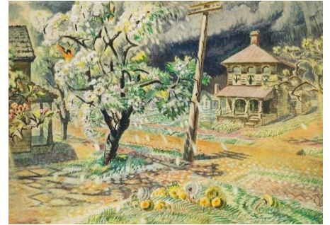
Charles Burchfield (1893-1967) Cherry Blossom Snow watercolor, gouache and charcoal on joined paper laid down on board Executed circa 1917-45. Price Realized: $1,812,500