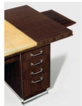
EMILE-JACQUES RUHLMANN (1879-1933) A 'Granet' Desk, Circa 1930 macassar ebony, oak, beech, bronze, chromium-plated steel $150,000–250,000