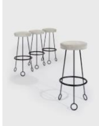
JEAN ROYERE (1902-1981)

A Pair of Armchairs, Model 'MF732', From The Grand Hotel De Tours, Circa 1924 macassar ebony, chromium-plated metal, upholstery $200,000–300,000