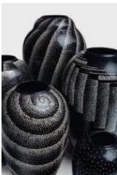
JEAN DUNAND (1877-1942) Vases, offered in separate lots with estimates ranging from $15,000-120,000