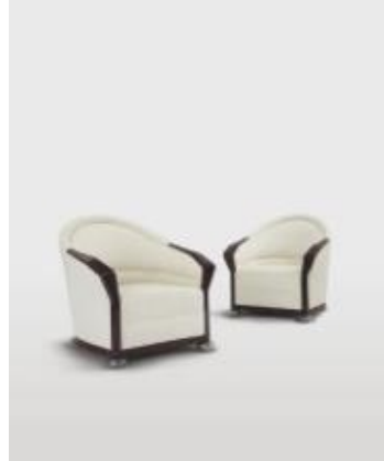
PIERRE CHAREAU (1883-1950)

A Folding Table, Circa 1928 palmwood, oxidized brass, patinated bronze, with three sections $80,000–120,000