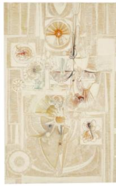
Bruce Conner (1933-2008) UNTITLED watercolor, ink and gouache on paper. 24 1/8 x 15 in. (61.3 x 38.1 cm.) Executed in 1956. Estimate: $10,000-15,000 Offered in On Paper , online from 20 - 26 February