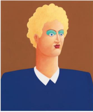
Nicolas Party (b. 1980) Portrait painted in 2014. 51 x 43 in (129.5 x 109.2 cm). Estimate: $80,000-120,000. Offered in Post-War to Present on 28 February 2019 at Christie's in New York