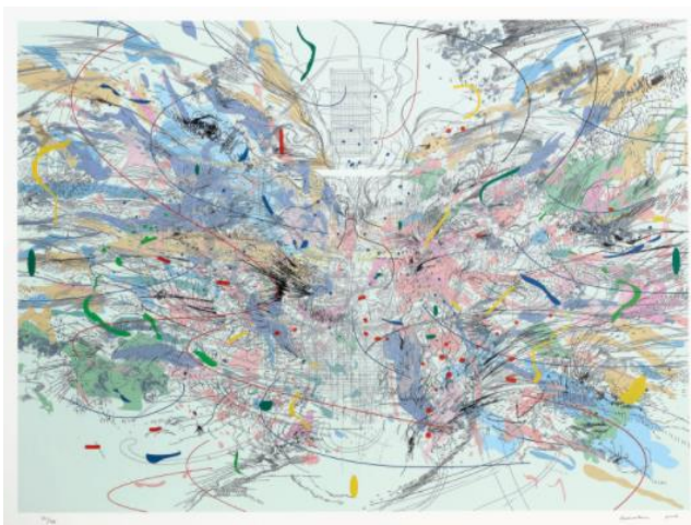
JULIE MEHRETU (B. 1970) Entropia (review) lithograph and screenprint in colors, 2004 Estimate: $15,000 - 25,000