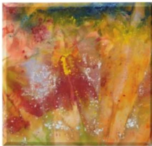
SAM GILLIAM (B. 1933) Untitled acrylic on shaped canvas. Painted in 1971 Estimate: $500,000 – 700,000

New York – Christie's will present three contemporary sales this February in New York, Contemporary Edition on 27 February, Post-War to Present on 28 February, and the online only sale, On Paper , which will run 20 - 26 February. Combined, the sales will encompass 500 lots, which span from emerging artists to established masters with estimates ranging from $700 to $1,000,000. The works will be on view and open to the public in Christie's New York galleries beginning 23 February through 28 February. Coinciding with the Contemporary Edition Sale, is the online-only auction Matisse on Paper: Prints and Drawings from the Estate of Jacquelyn Miller Matisse running 21 February through 1 March.