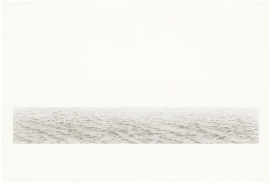
VIJA CELMINS Untitled (Long Ocean #5) graphite on paper with acrylic ground Executed 1972 Estimate: $1,500,000 – 2,000,000