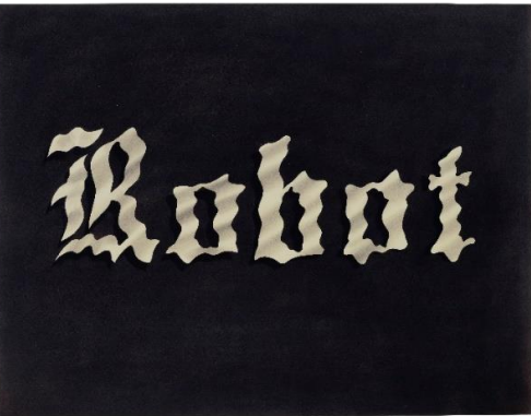
ED RUSCHA Wavy Robot gunpowder on paper Executed in 1975 Estimate: $400,000 – 600,000