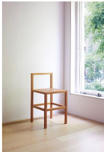
DONALD JUDD Frame Chair, no. 72 Executed 1993 Estimate: $20,000 – 30,000