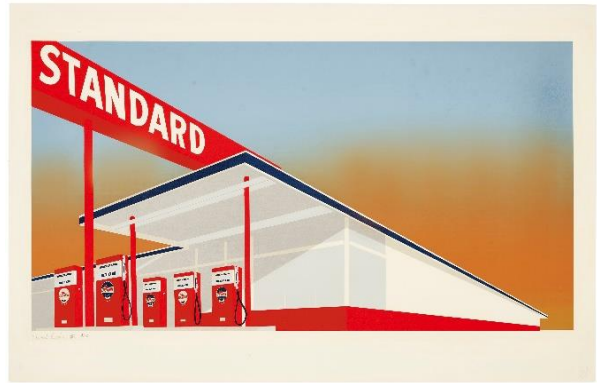
ED RUSCHA Standard Station (Engberg 5) screenprint in colors Executed 1966 Estimate: $200,000 – 300,000