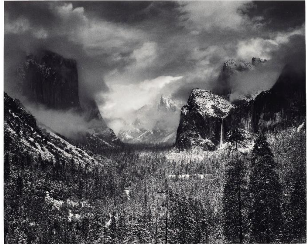
Ansel Adams (1902–1984)

Clearing Winter Storm, Yosemite Valley, California, 1938 gelatin silver print, mounted on board, printed 1978-1984 titled in ink in photographer's Carmel credit stamp [BMFA Stamp I], with Center for Creative Photography & AAPRT stamps (mount, verso)