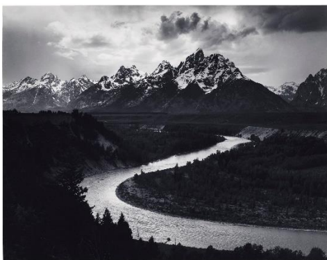
The Tetons and the Snake River, Grand Teton National Park, Wyoming, 1942 gelatin silver print, mounted on board, printed probably 1963-1973 signed in ink (mount, recto); titled and dated in ink in photographer’s Carmel credit stamp [BMFA Stamp 7] and with Center for Creative Photography & AAPRT stamps (mount, verso) Estimate: $20,000-30,000