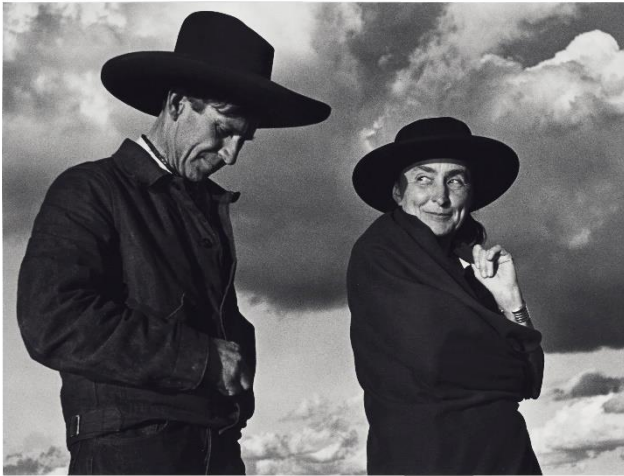
Ansel Adams (1902–1984)

Sold to Establish a New Acquisition Endowment in Order to Diversify the Center's Permanent Collection