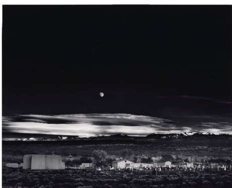
Moonrise, Hernandez, New Mexico, 1941 gelatin silver print, mounted on board, printed 1973-1977 signed in pencil (mount, recto); titled and dated in ink in photographer’s Carmel credit stamp [BMFA Stamp 11], and with Center for Creative Photography & AAPRT stamps (mount, verso) Estimate: $30,000-50,000