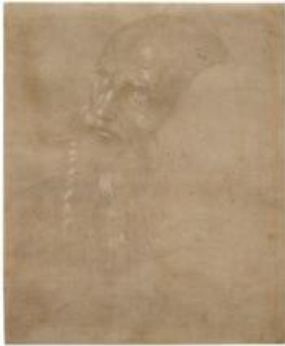
PIETRO DI CRISTOFORO VANNUCCI, CALLED PERUGINO (CITTÀ DELLA PIEVE CIRCA 1450-1523 FONTIGNANO) Head of an Apostle metalpoint (silver?) heightened with white on gray prepared paper 9.5 x 7.9 in. (24.10 x 20 cm) Estimate: $200,000-300,000