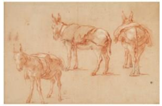
GIOVANNI BATTISTA TIEPOLO (VENICE 1696- 1770 MADRID) Three studies of a donkey red and white chalk 12 1/4 x 18 3/4 in. (31 x 47.6 cm) Estimate: $250,000-350,000