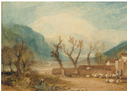
JOSEPH MALLORD WILLIAM TURNER, R.A. (LONDON 1775-1851) Mont Blanc from the Bridge of St. Martin, Sallanches pencil and watercolor heightened with bodycolor and gum arabic and with scratching out 11 1/4 x 15 3/4 in. (28.5 cm. x 40 cm.) Estimate: $200,000-300,000