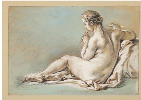
FRANÇOIS BOUCHER (PARIS 1703-1770) A nude woman playing a flute, seen from behind black, red and white chalk with pastel on blue paper 9 1/2 x 14 in. (24 x 36 cm) Estimate: $20,000-30,000