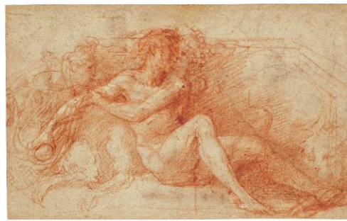
GIROLAMO FRANCESCO MAZZOLA, IL PARMIGIANINO (PARMA 1503-1540 CASALMAGGIORE) Daniel in the lions' den red chalk 3 1/2 x 5 7/8 in. (9 x 15 cm) Estimate: $60,000-80,000