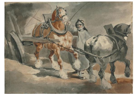
JEAN-LOUIS-ANDRÉ-THÉODORE GÉRICAUT (ROUEN 1791-1824 PARIS) The coal wagon; Study of a horse, with a second study of a horse graphite, pen and gray ink, watercolor 7 3/4 x 10 3/4 in. (19.6 x 27.3 cm) Estimate: $200,000-300,000